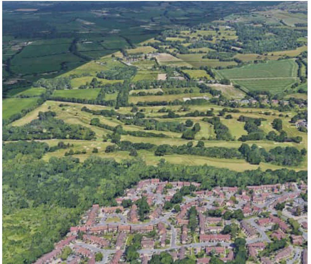
Ancient Parish [West of Ifield - North Sussex]