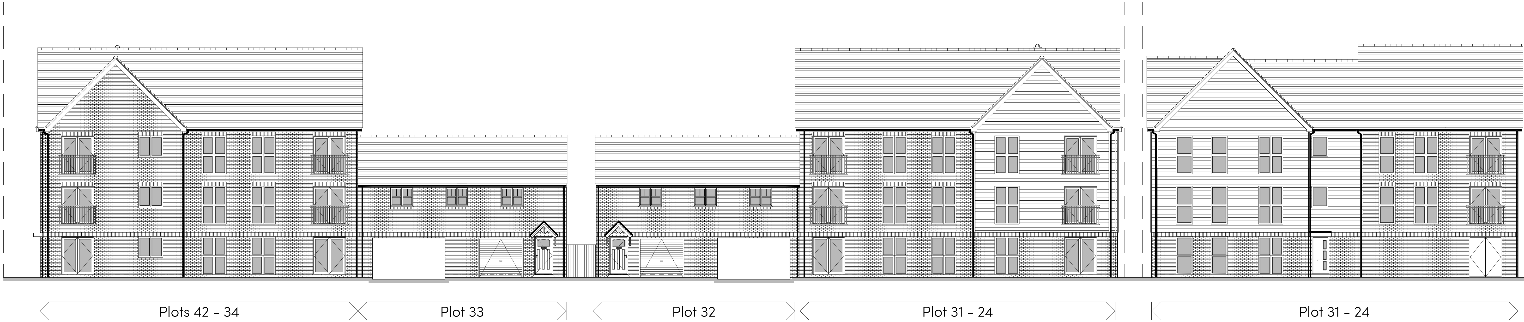
PROPOSED STREET SCENE B-B PART 1