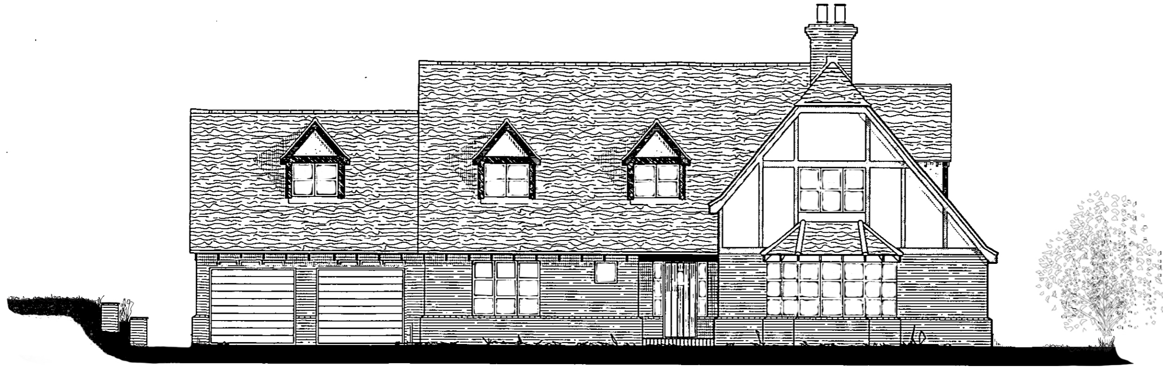
Current Elevation - North: existing garage