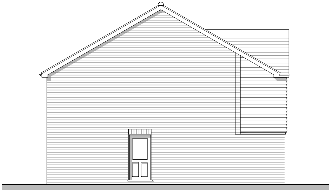
Side Elevation B