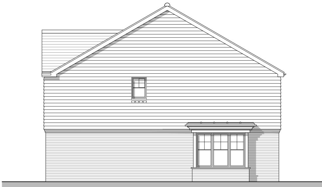
Side Elevation A