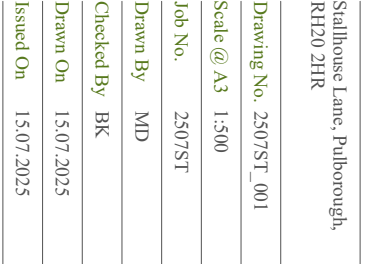
Drawing Block Plan