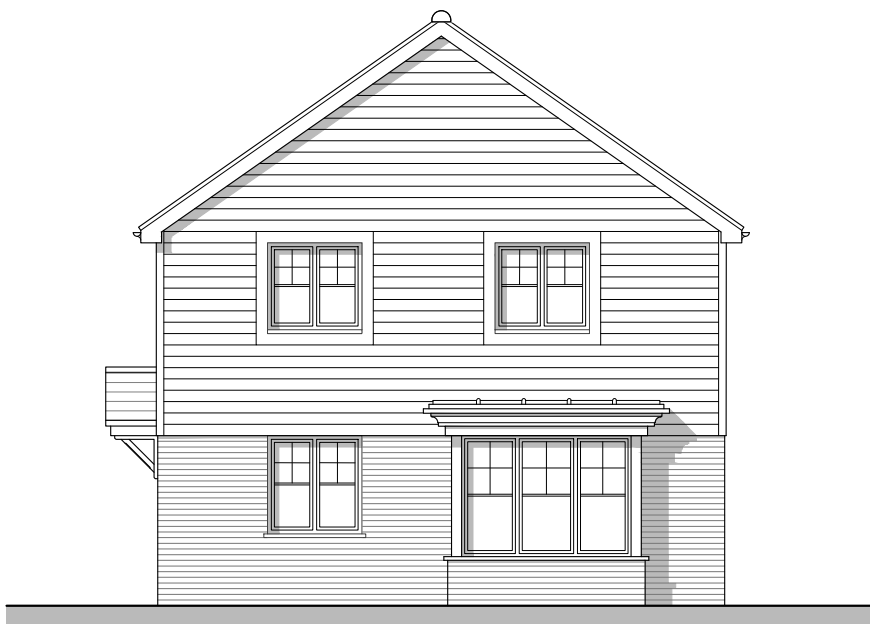
Side Elevation A