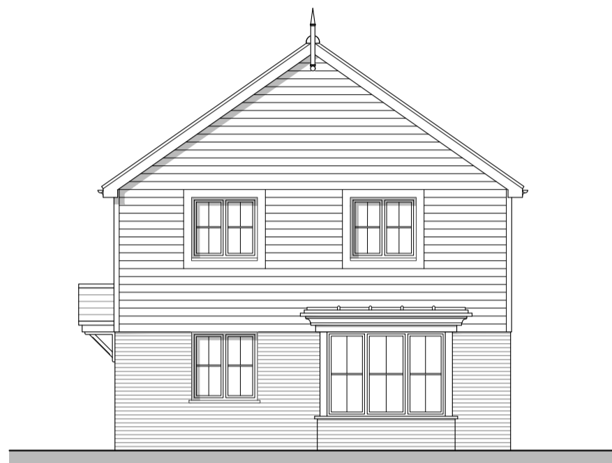
Side Elevation A