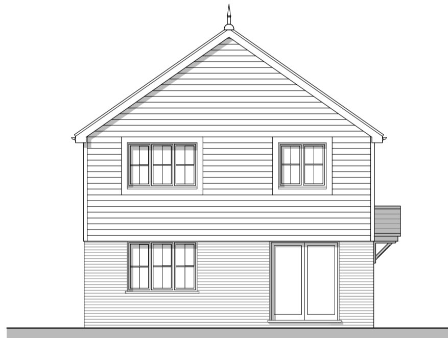
Side Elevation B