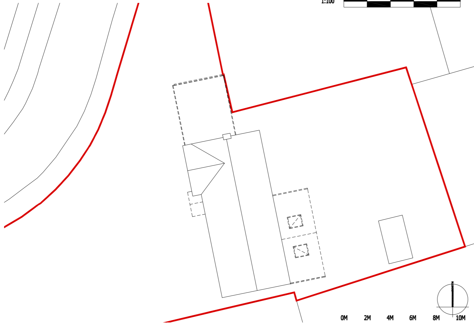
PROPOSED ROOF PLAN IN CONTEXT 1.200