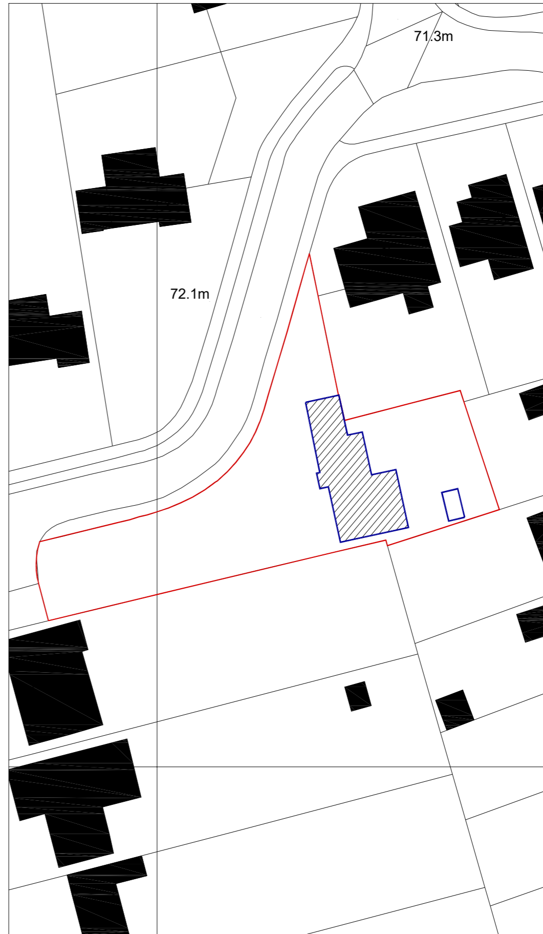
PROPOSED SITE BLOCK PLAN 1.500