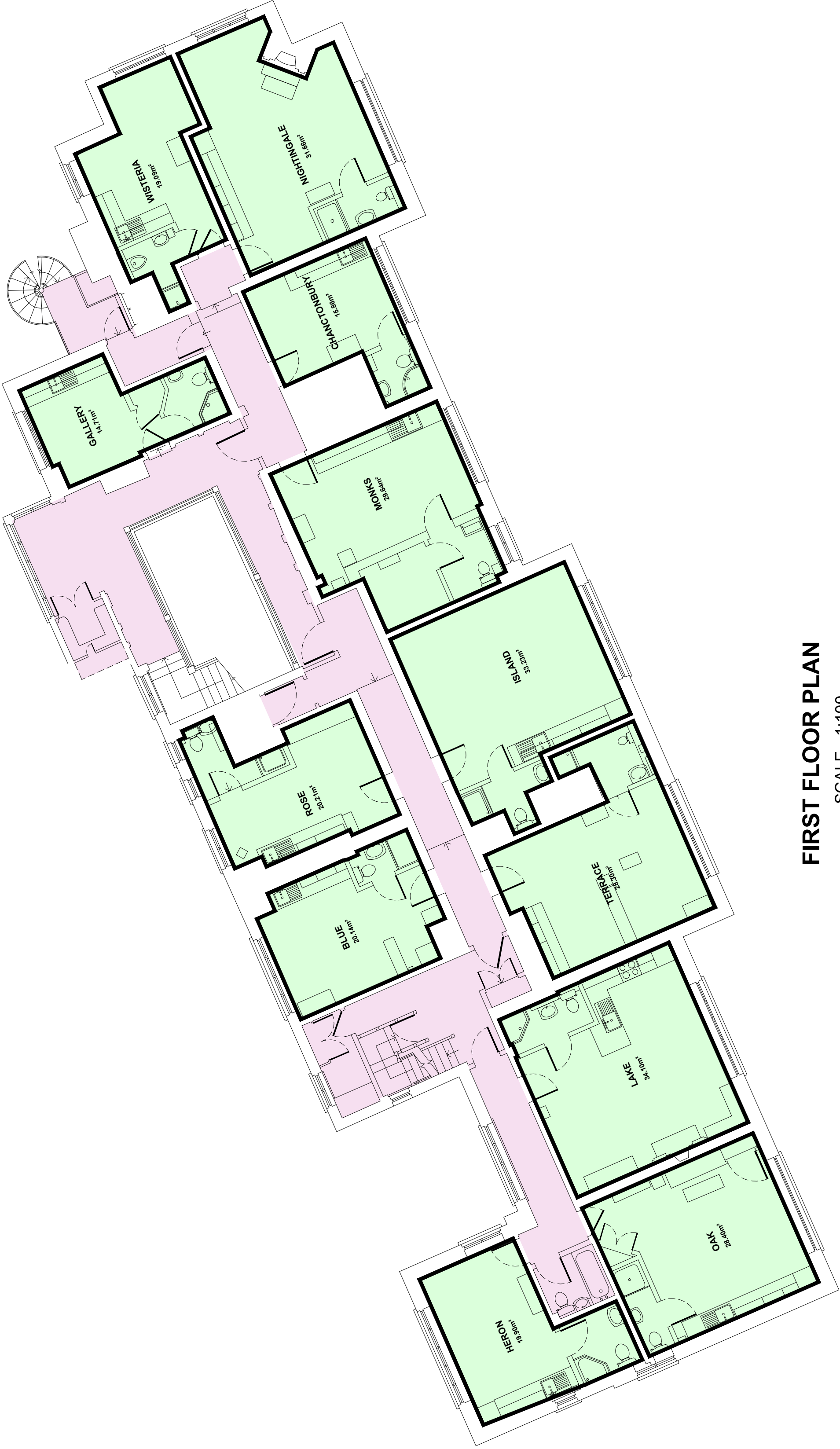
FIRST FLOOR PLAN SCALE - 1:100