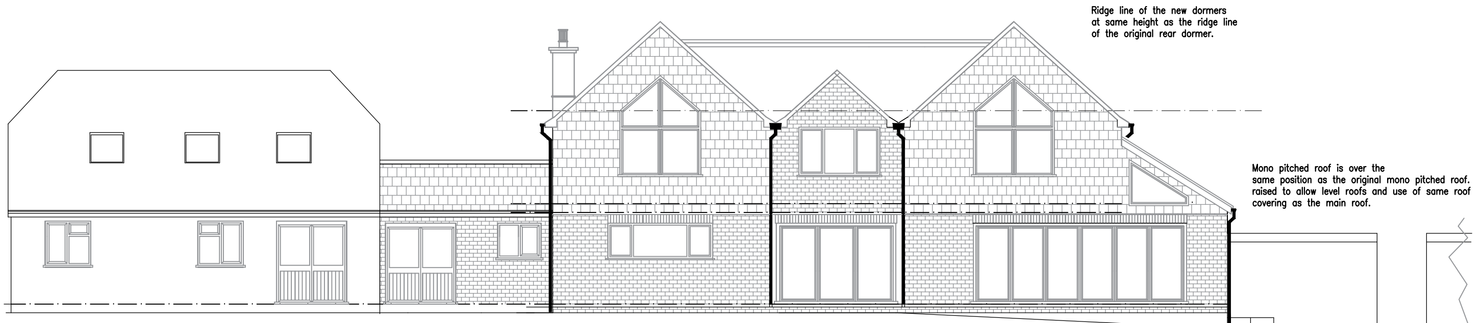
PROPOSED REAR ELEVATION WEST

Materials to be used in the construction of the new extensions are to match those of the original house as closely as possible. To ensure that the proposed works harmonies with the existing house.