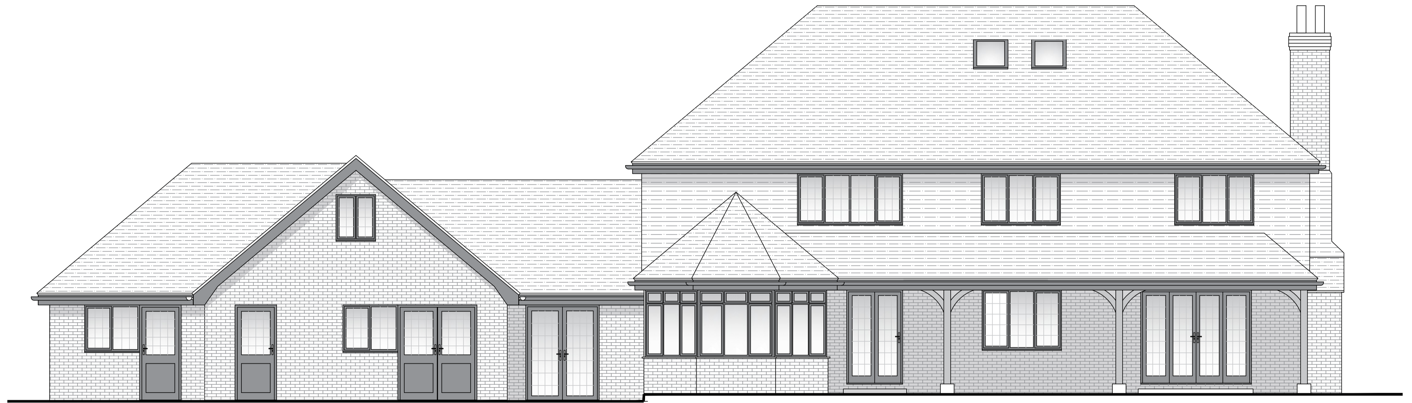
Proposed Rear Elevation (Scale 1:50)