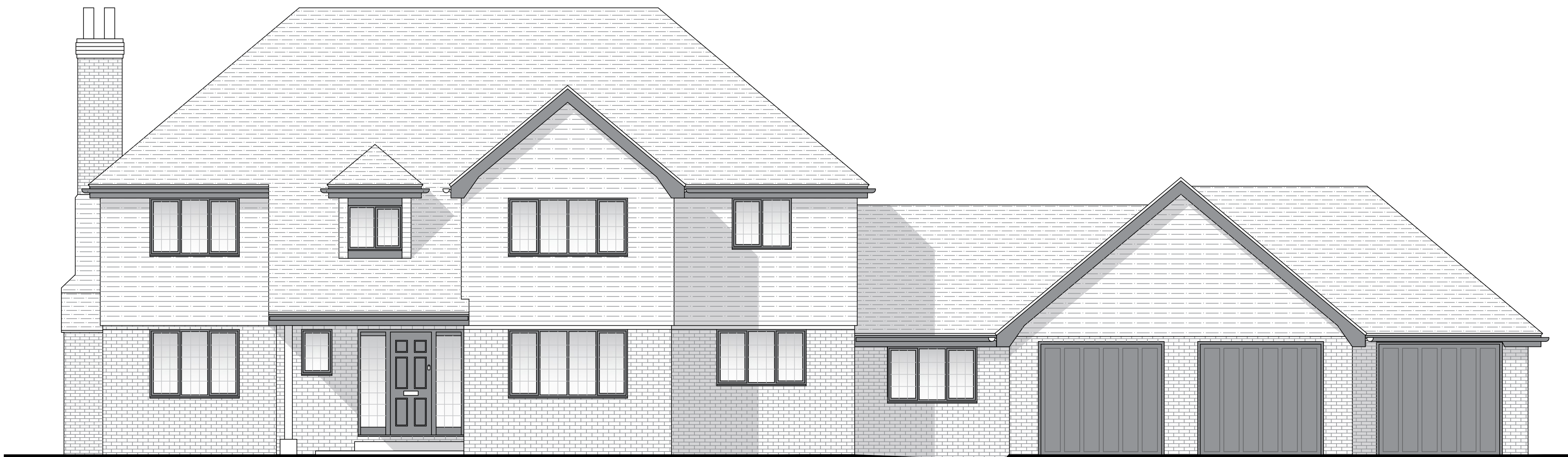
Proposed Rear Elevation (Scale 1:50)