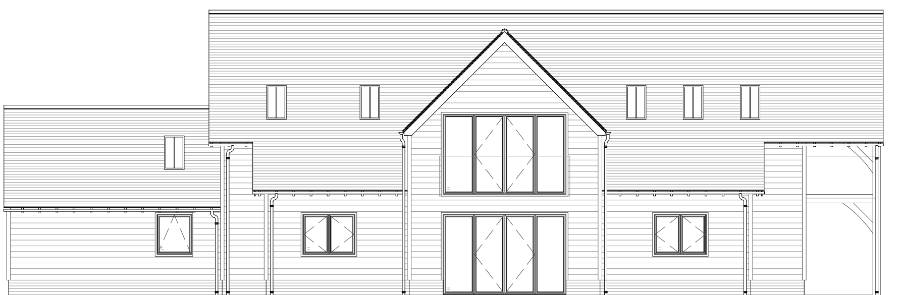
North 1:100 | PROPOSED