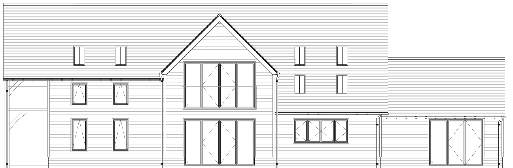
South 1:100 | PROPOSED