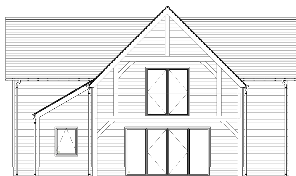
West 1:100 | PROPOSED

This drawing is the copyright of Manorwood Construction Ltd but may be used for planning purposes by the Local Authority without breach of copyright.