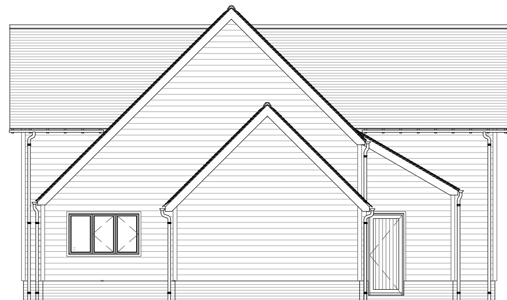
East 1:100 | PROPOSED