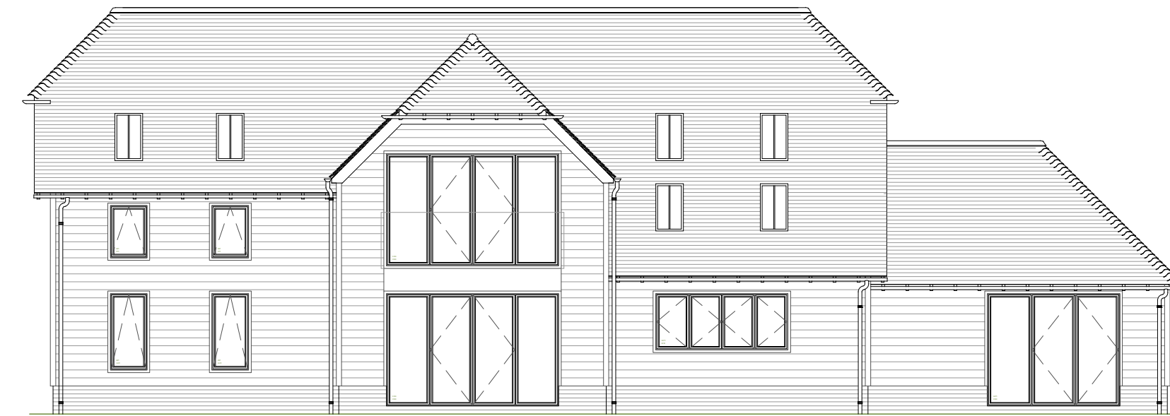
South 1:100 | PROPOSED