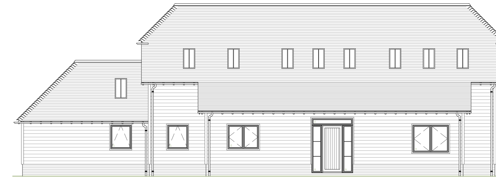
North 1:100 | PROPOSED