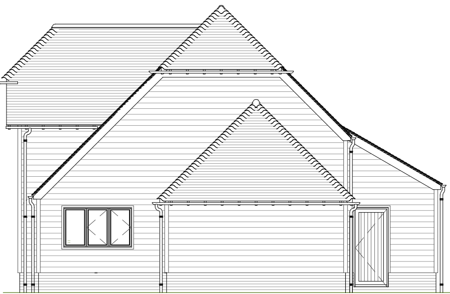
East 1:100 | PROPOSED