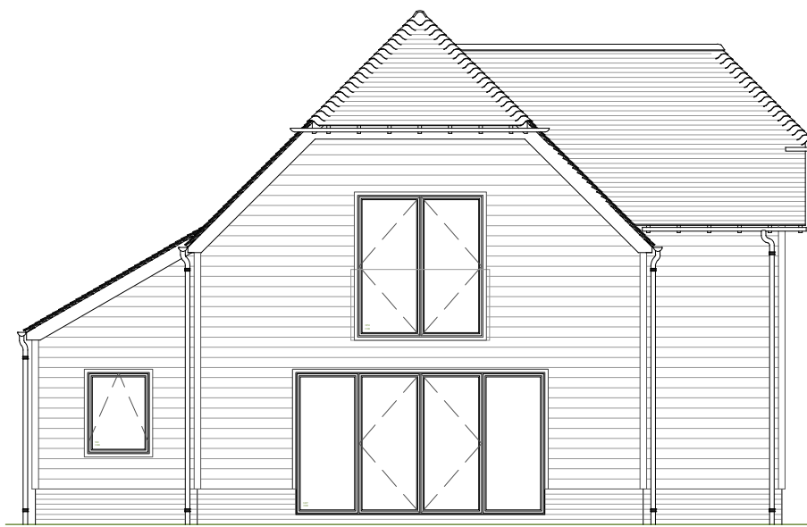
West 1:100 | PROPOSED