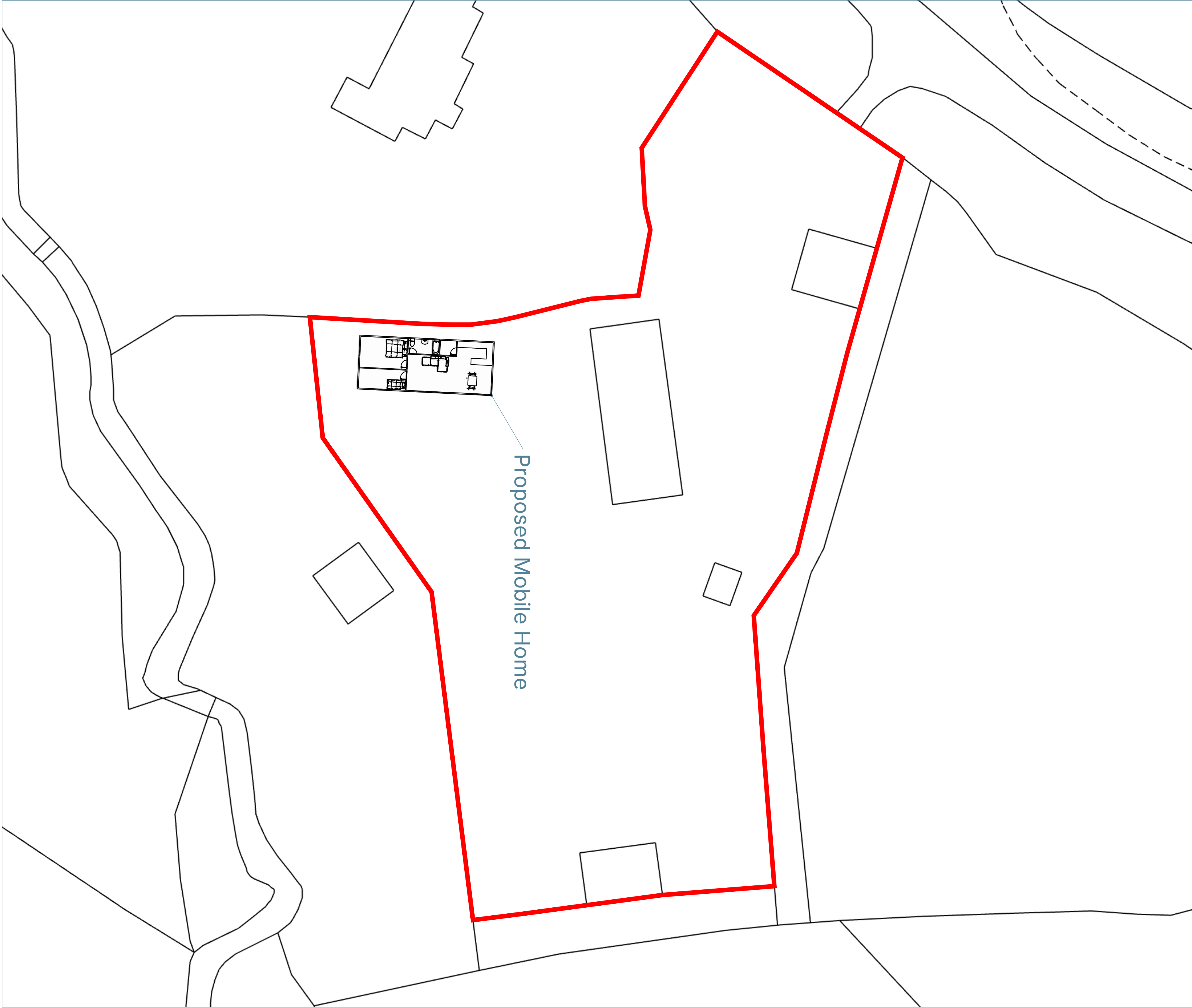
Site Plan as Proposed - 1:200