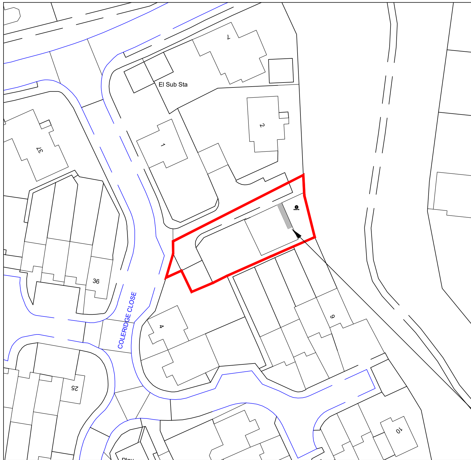
SITE BLOCK PLAN (1:500)