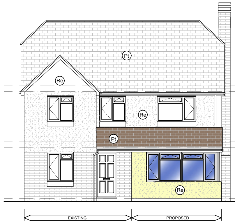
PROPOSED EAST ELEVATION SCALE 1:100