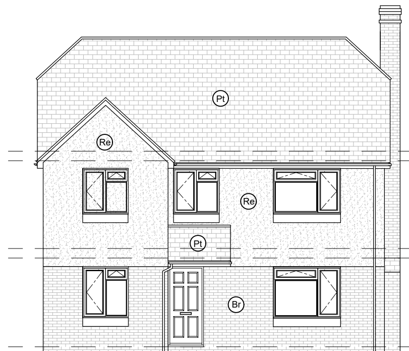
EXISTING EAST ELEVATION SCALE 1:100