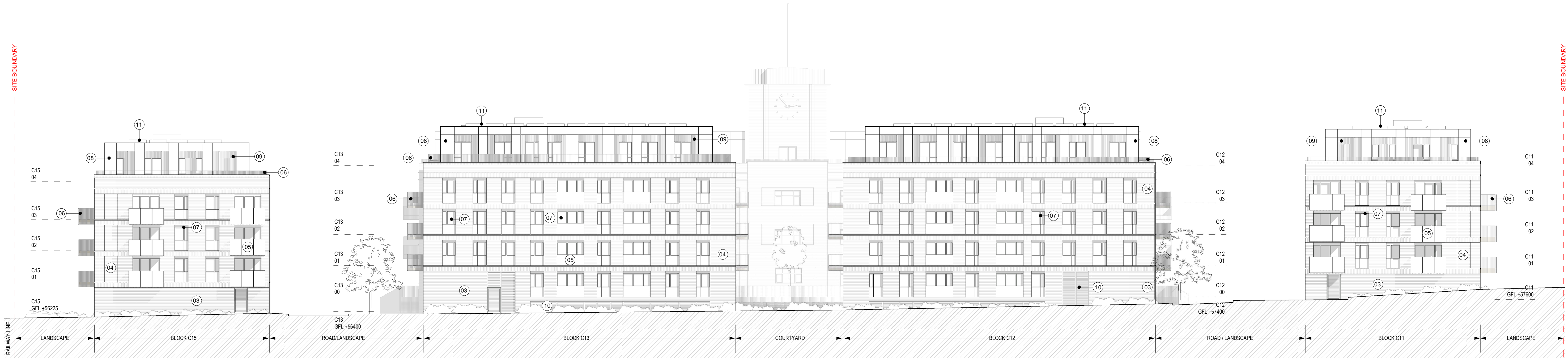
2 Heritage Building and Apartment Blocks - South East Elevation 1 : 200