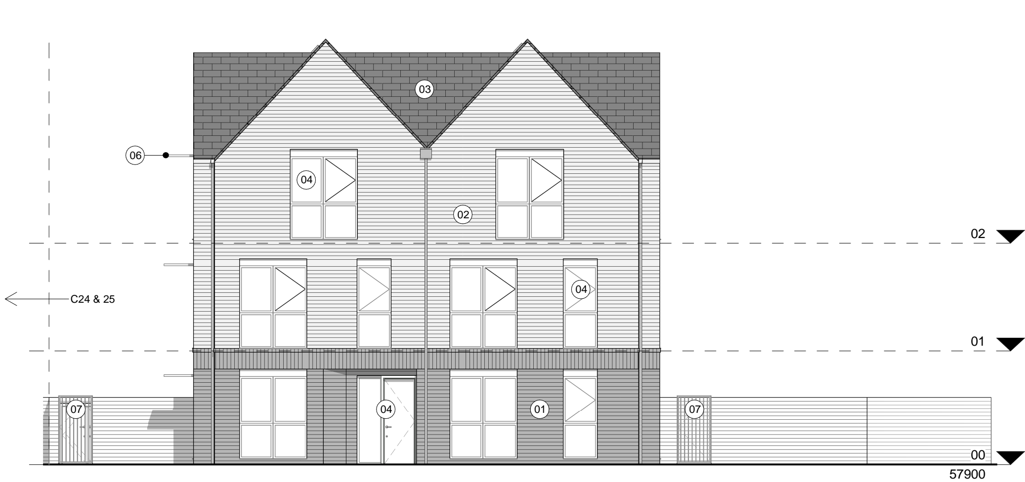
1 4B7P T1 & T2 Gatehouse North East 1 : 100