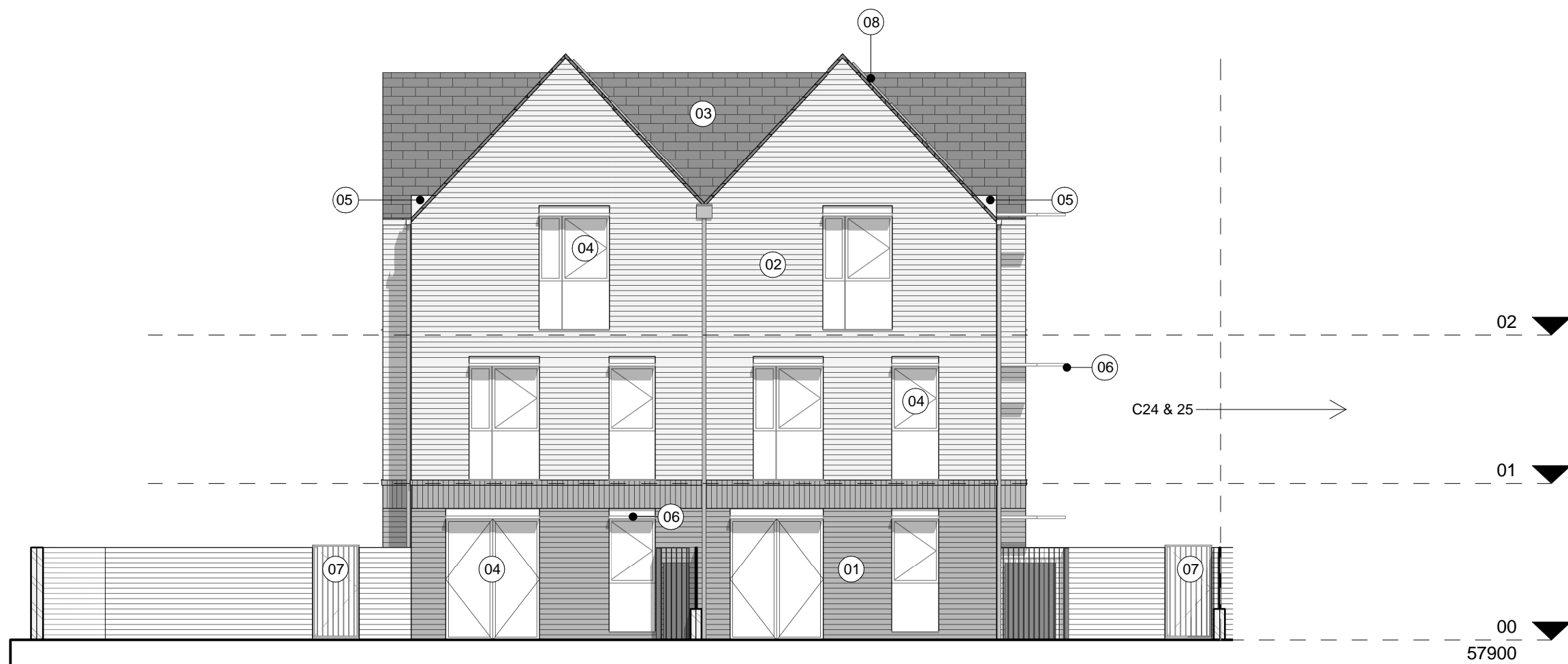
2 4B7P T1 & T2 Gatehouse South West 1 : 100