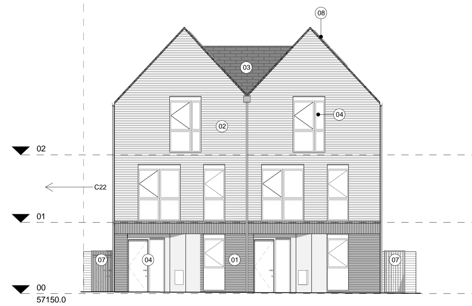
2 3B6P T1 - North West Elevation 1:100