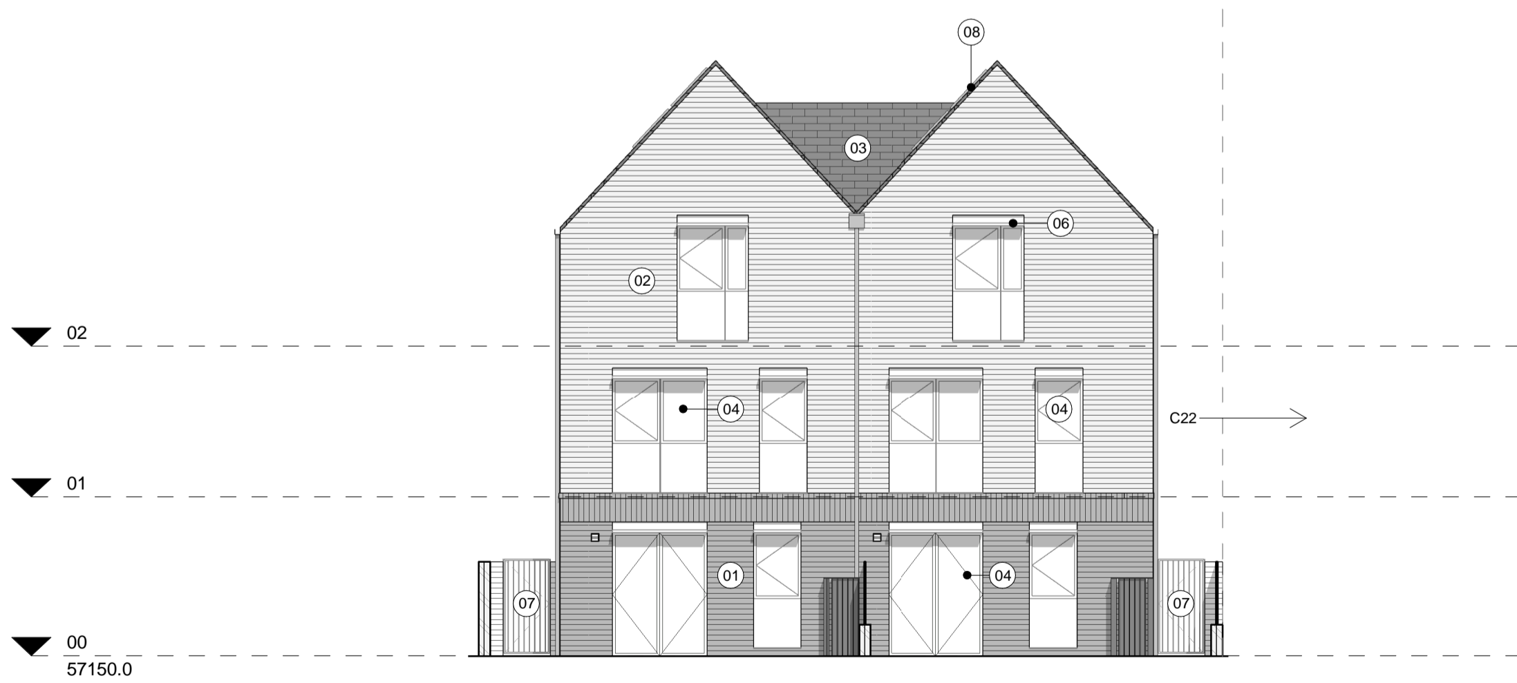
4 3B6P T1 - South East Elevation 1:100