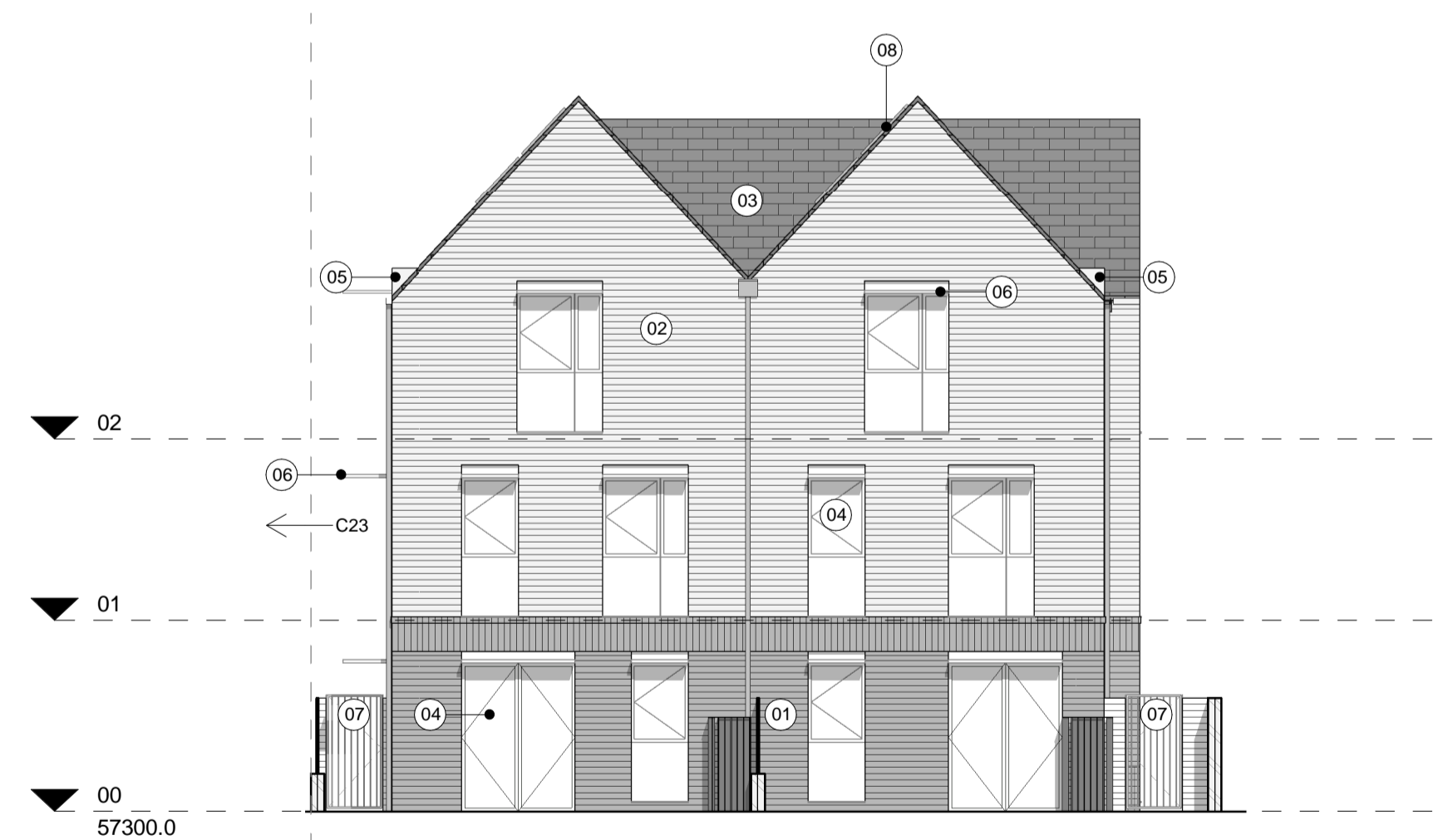
4 4B7P T1 and 3B6P T3 - South East Elevation