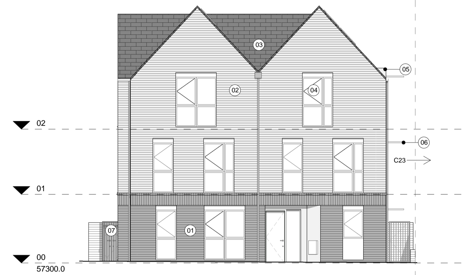
2 4B7P T1 and 3B6P T3 - North West Elevation