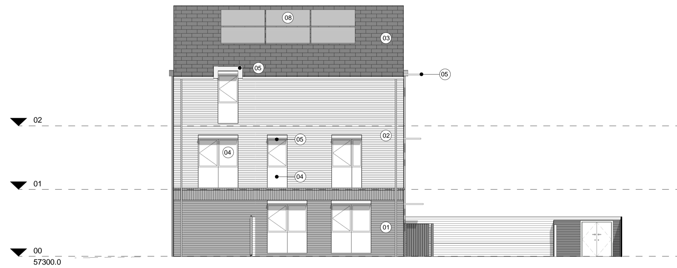
1 4B7P T1 and 3B6P T3 - South West Elevation