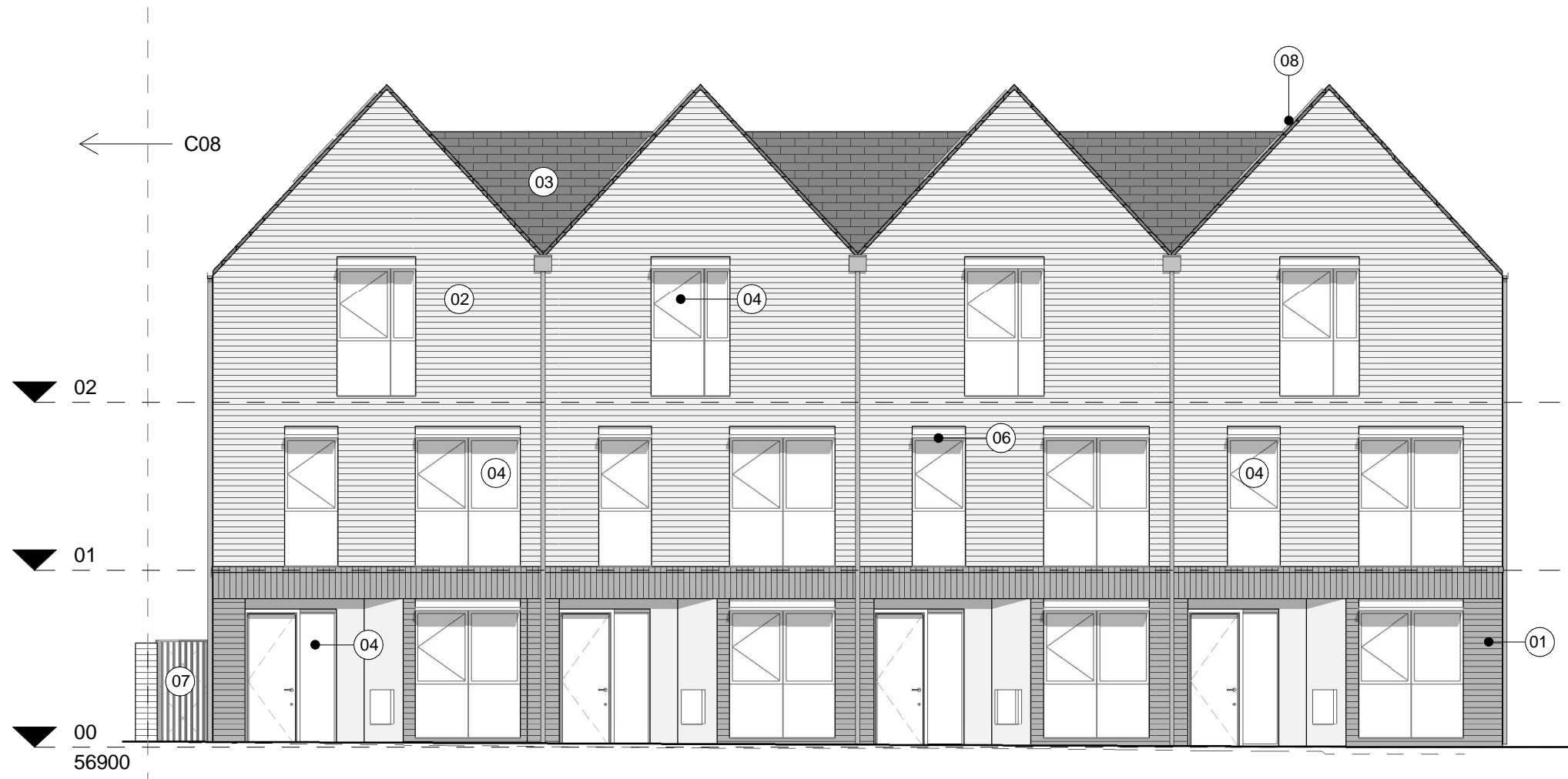
2 3B6P T2 - South East Elevation 1 : 100