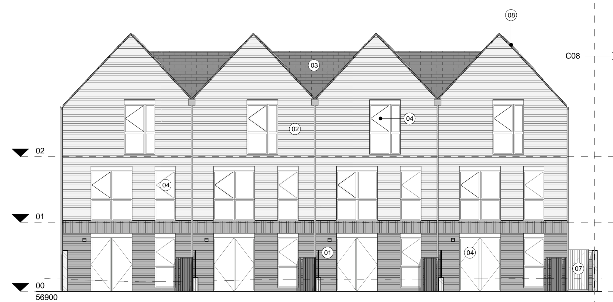
4 3B6P T2 - North West Elevation 1 : 100

All dimensions to be checked on site. Drawing to be read in conjunction with all relevant Architectural, Interiors, Structural, M&E, Drainage/ Public Health, Landscape and Civils drawings and specifications. Any discrepancies between consultant's drawings to be reported to the Architect before any work commences. The Contractor's attention is drawn to the Health & Safety matters identified in the Health & Safety plan as being potentially hazardous. These items should not be considered as a full and final list.