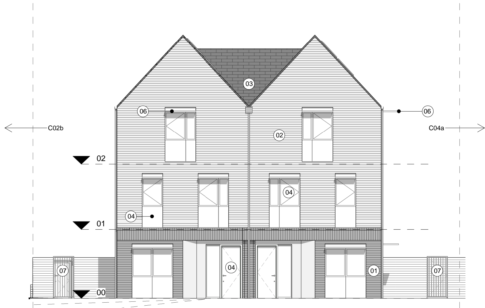
2 Gatehouse 4B7P T4 - South West Elevation 1 : 100