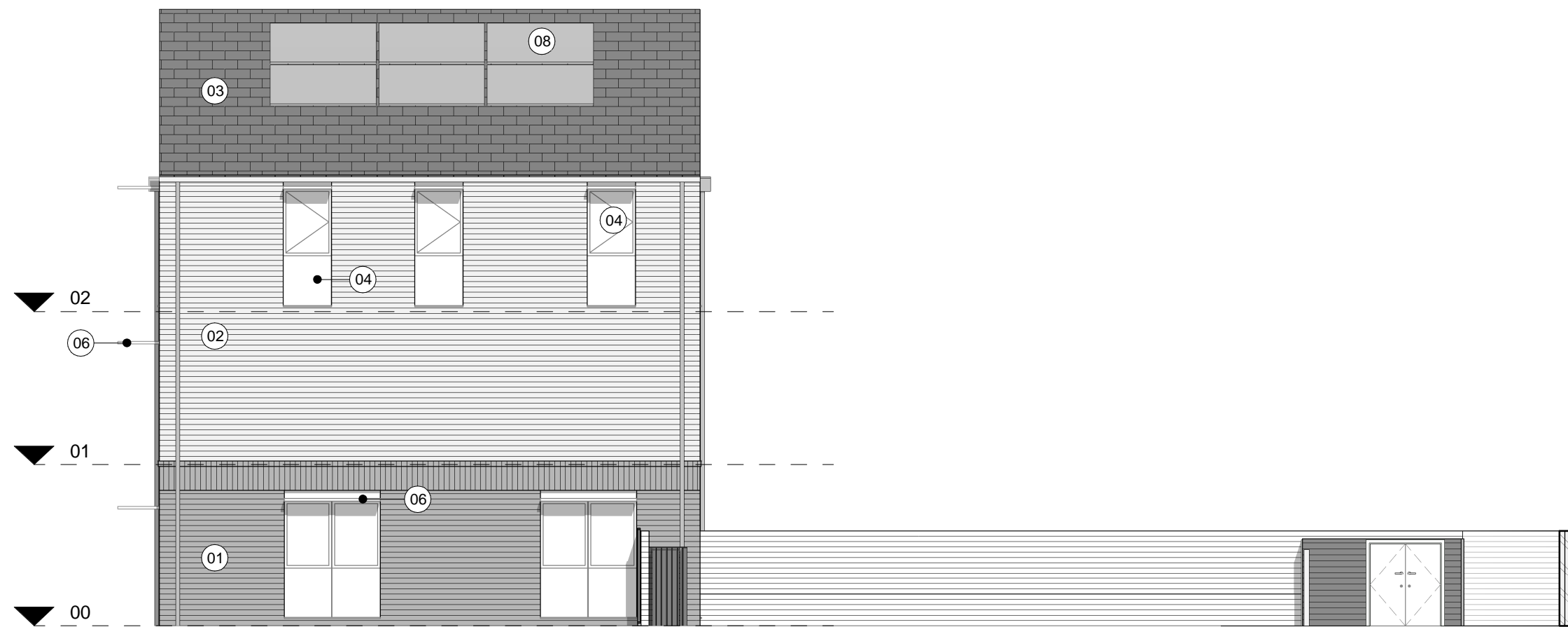
3 Gatehouse 4B7P T4 - South East Elevation 1 : 100