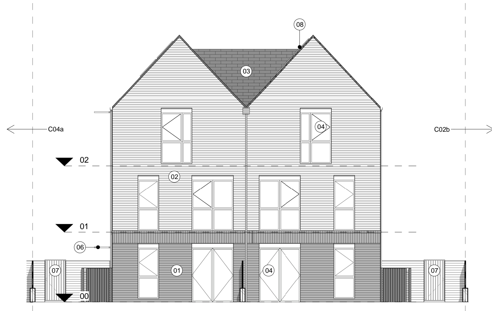
1 Gatehouse 4B7P T4 - North East Elevation 1 : 100