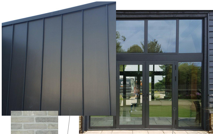
Dark standing seam metal cladding