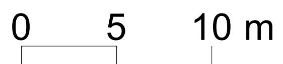
1 Tree Protection Plan Scale: 1:200

Tree Protection Fencing with ground protection