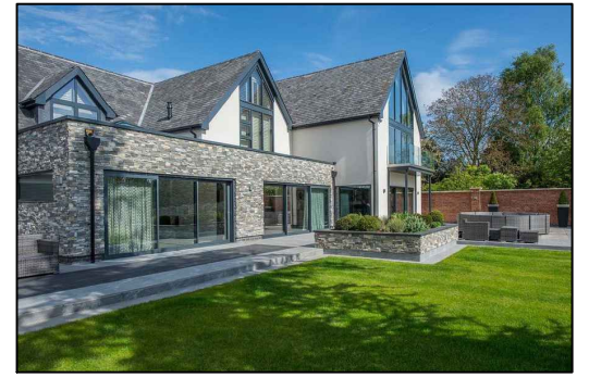
EXAMPLE SHOWING EXTERNAL FINISHES SCALE 1:100

Copyright reserved. This drawing may only be used for the client and location specified in the title block. It may not be copied or disclosed to any other third party without prior written consent from DMA Building Designs. Prior to any works commencing on site, DMA Building Designs is to be contacted regarding the current status, revision or regulatory approval of this drawing. 1. The works shown have been drawn for submission to the local planning authority and are not to be used for construction. 2. No works shall commence until planning approval has been given by the local authority. 3. 4. 5.