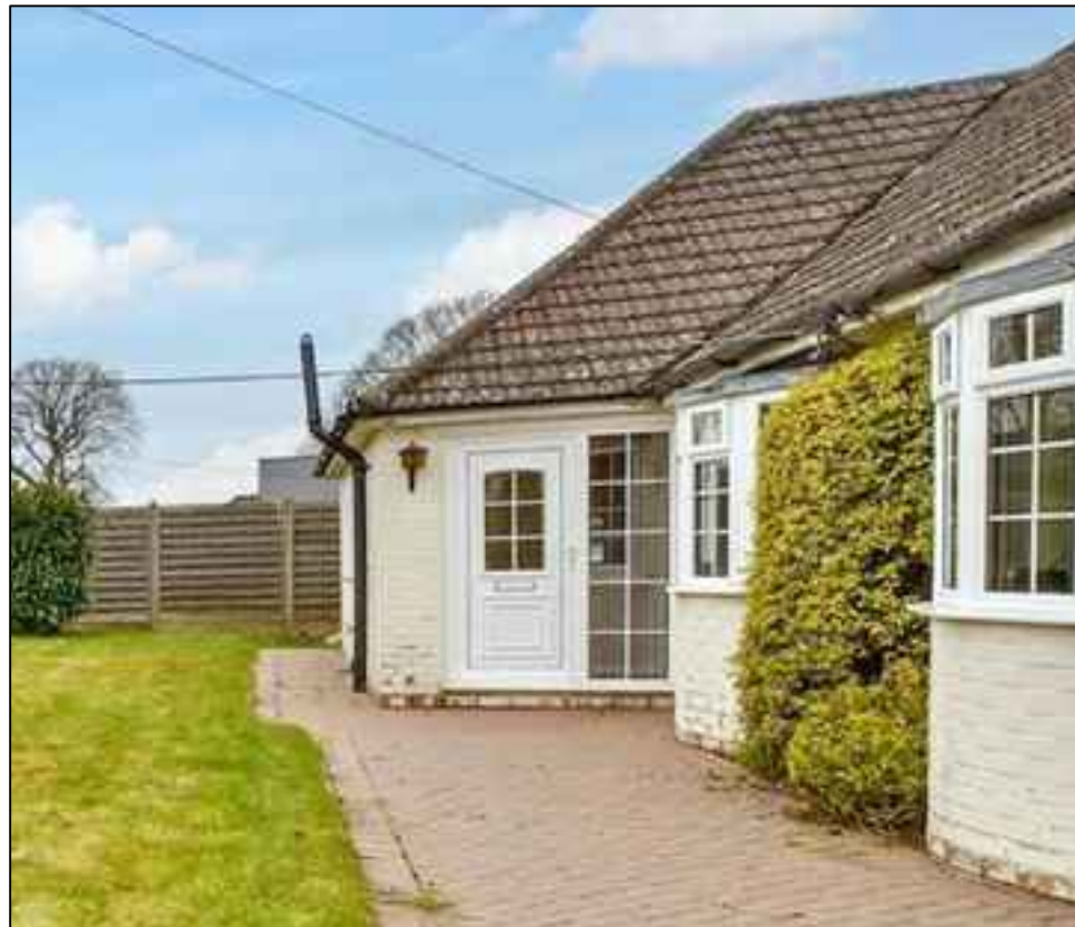
2 - Front Entrance Door