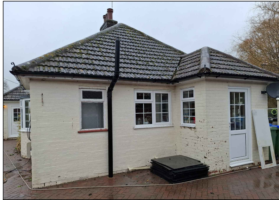
4 - Side View