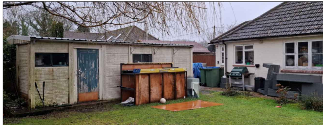
5 - Out Building