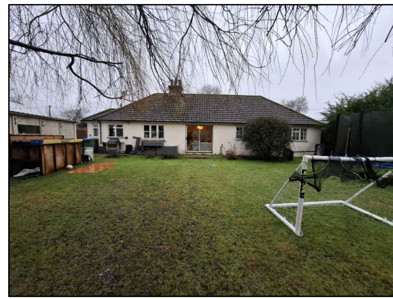
3 - Rear View