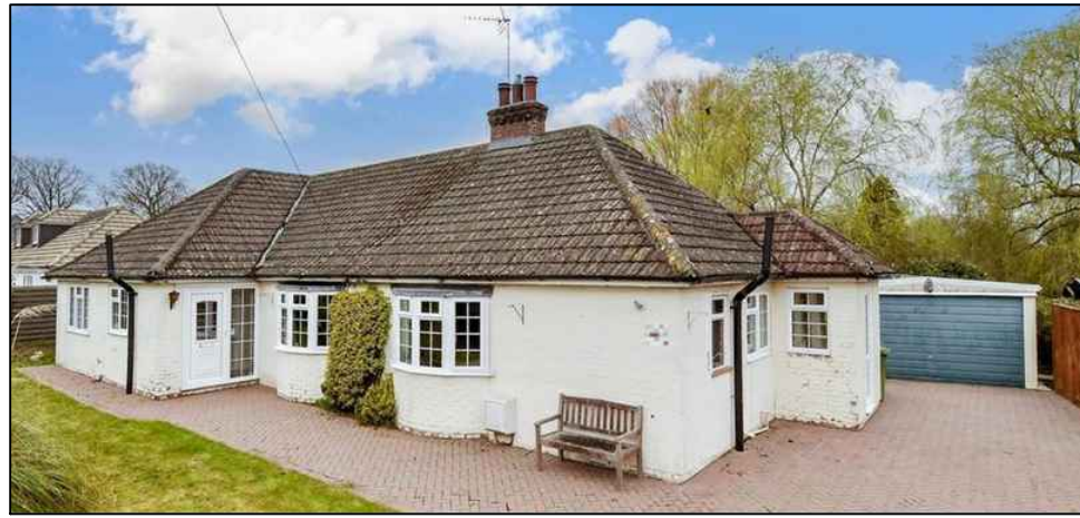
1 - Front View