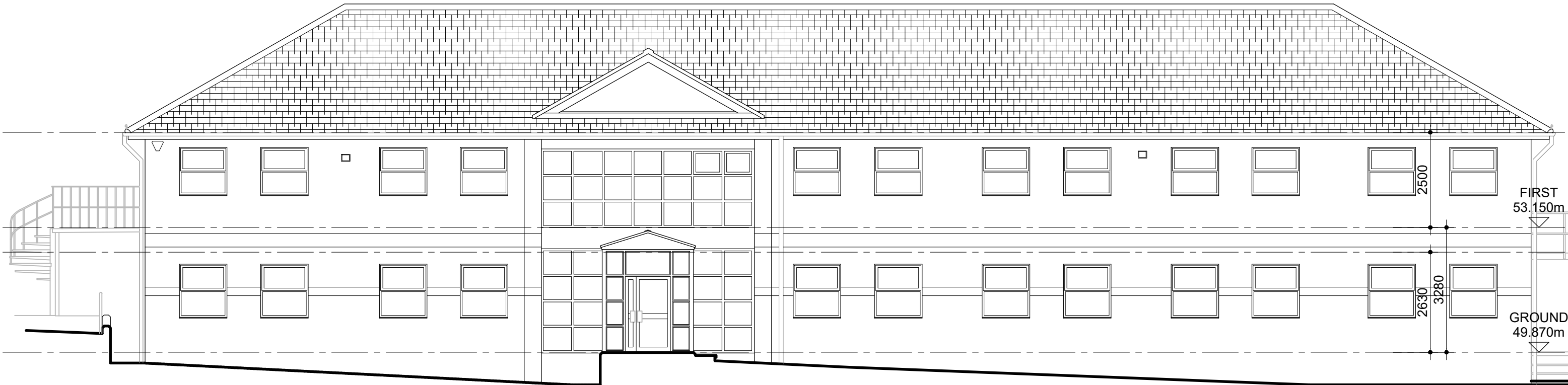
NORTH ELEVATION - AS EXISTING AND AS PROPOSED