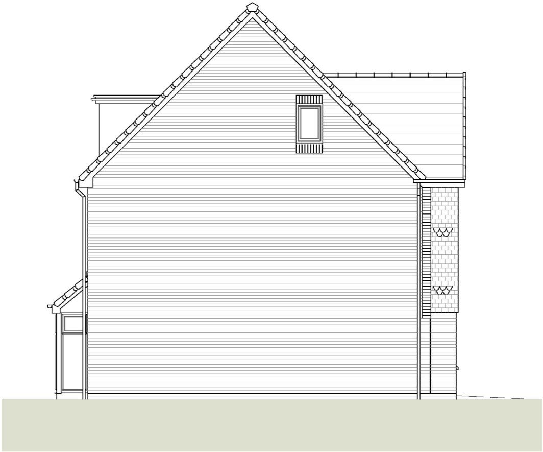
2 Gable Elevation 1 : 100