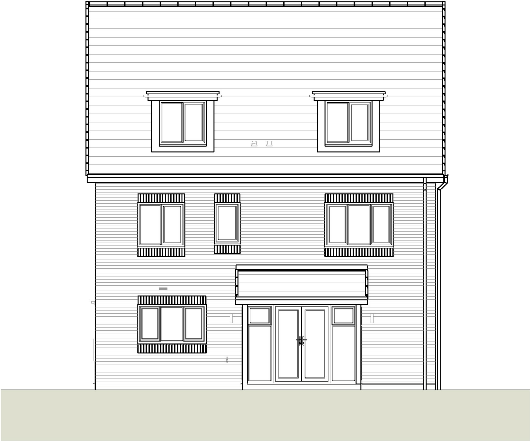
3 Rear Elevation 1 : 100