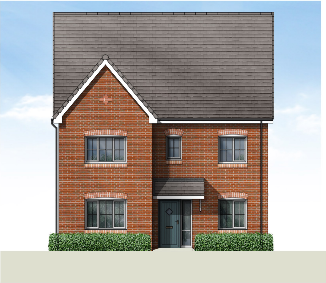
1 Front Elevation 1 : 100