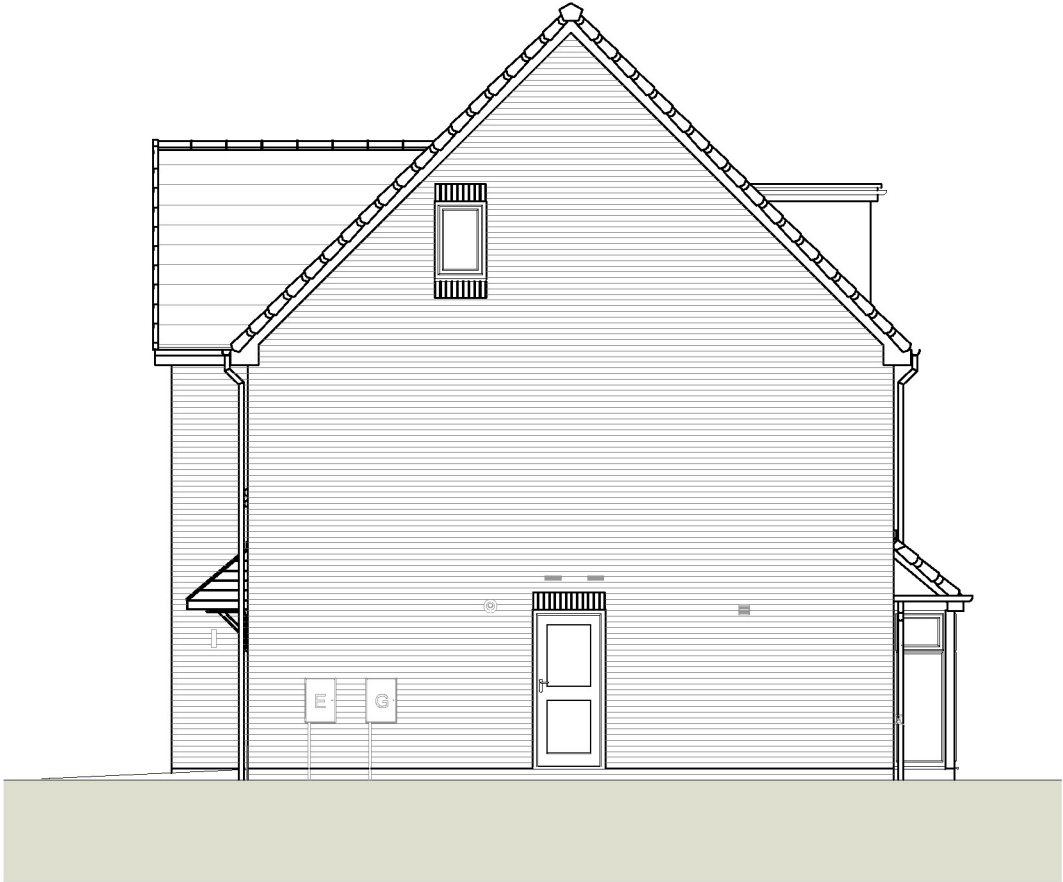
4 Gable Elevation 1 : 100