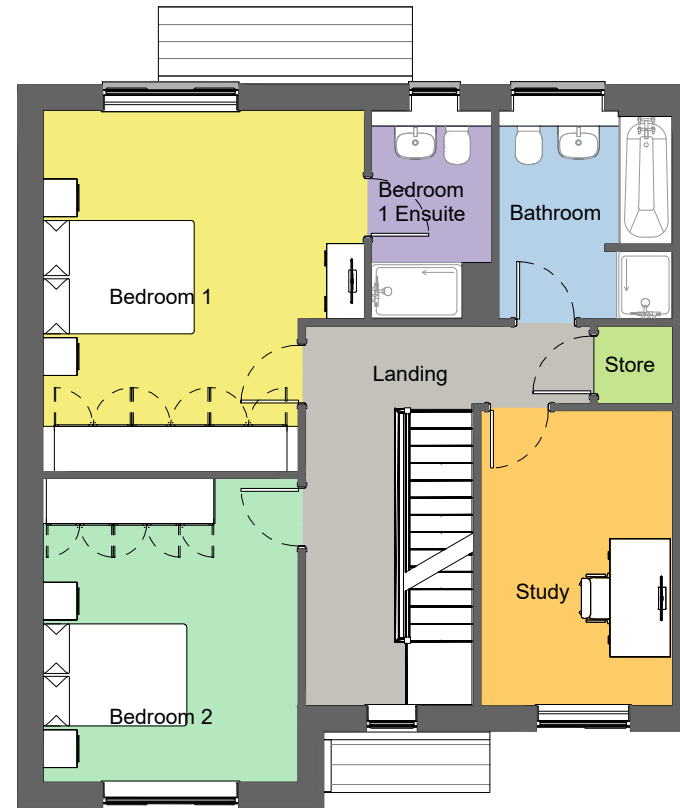
2 First Floor 1 : 100