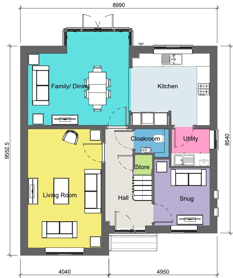
1 Ground Floor 1 : 100