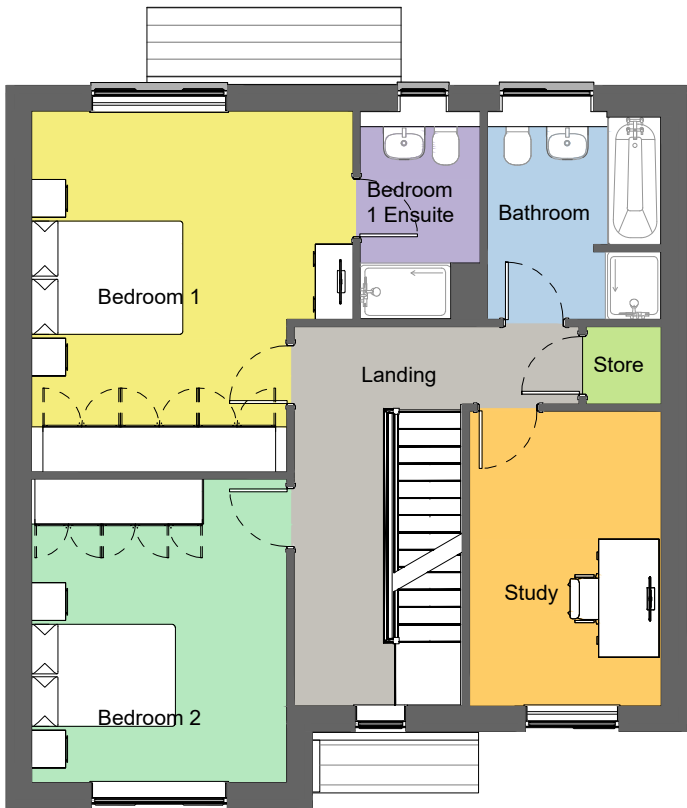
2 First Floor 1 : 100