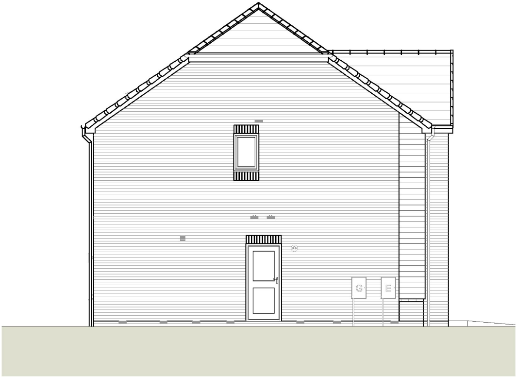
2 Gable Elevation 1 : 100