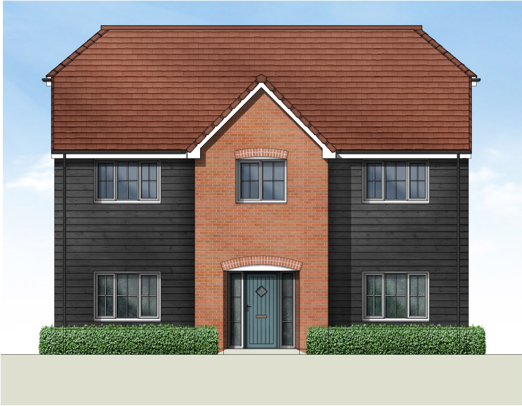
1 Front Elevation 1 : 100