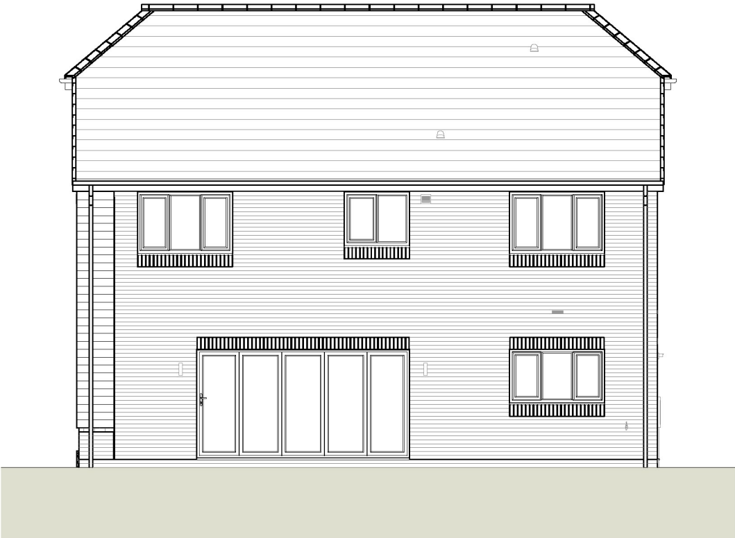
3 Rear Elevation 1 : 100