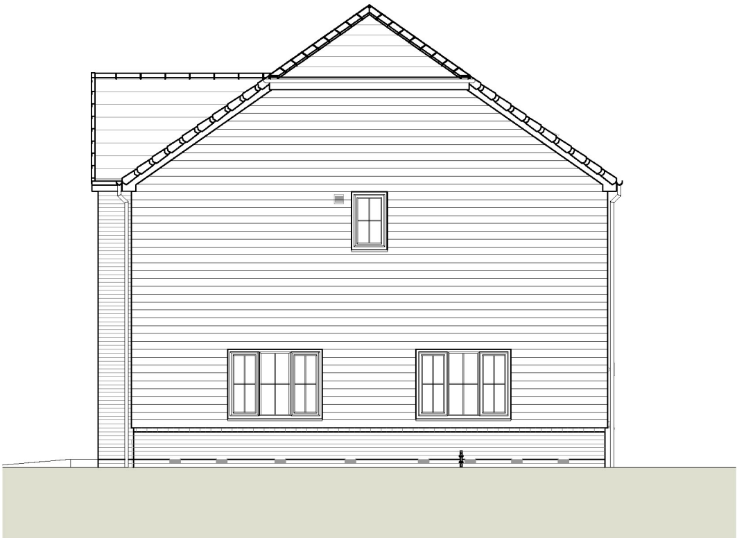
4 Gable Elevation 1 : 100