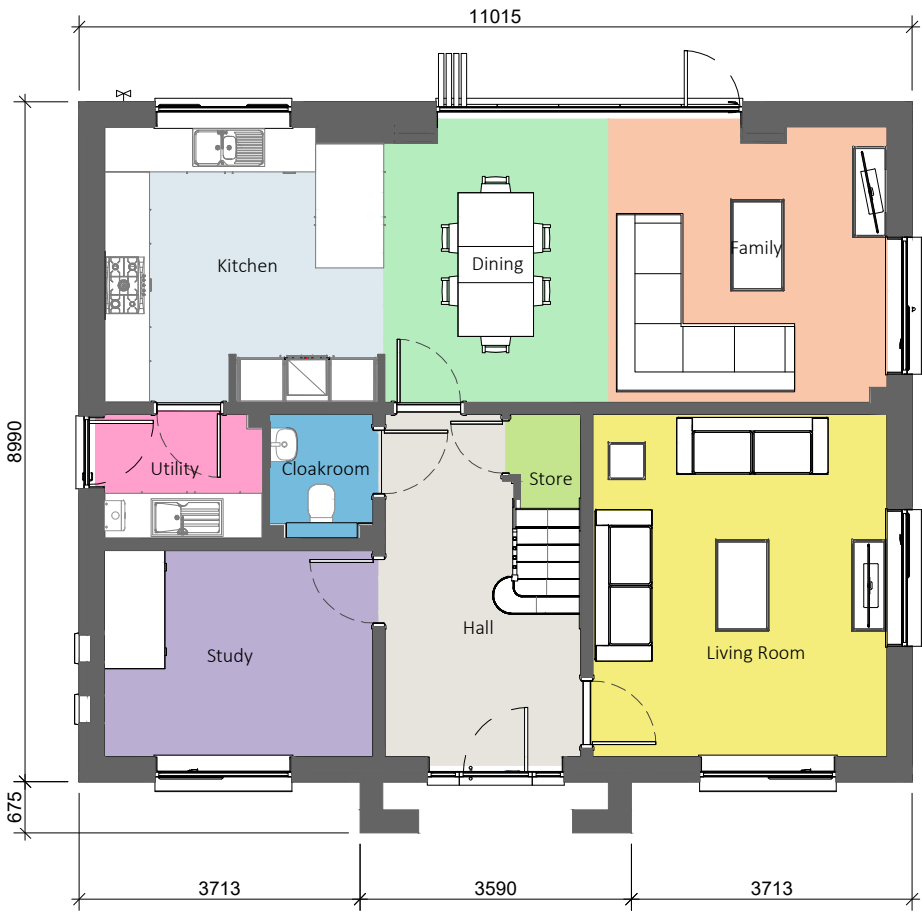
1 Ground Floor 1 : 100