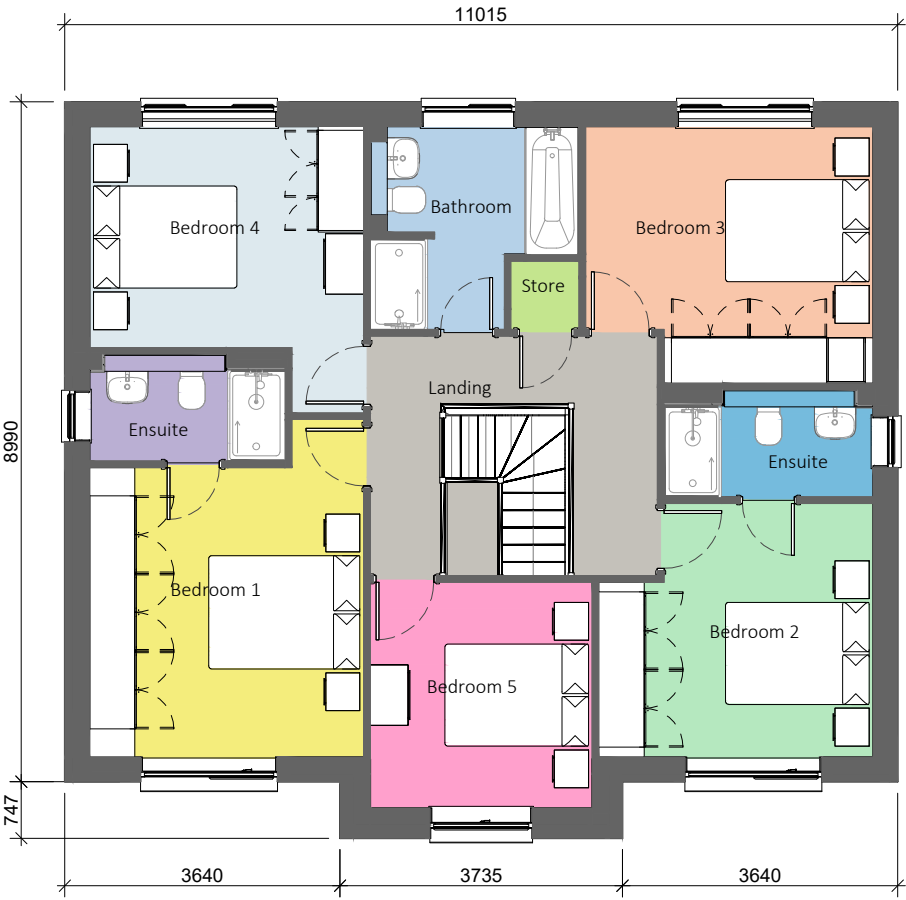
2 First Floor 1 : 100