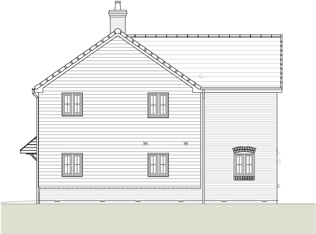
4 Gable Elevation 1 : 100