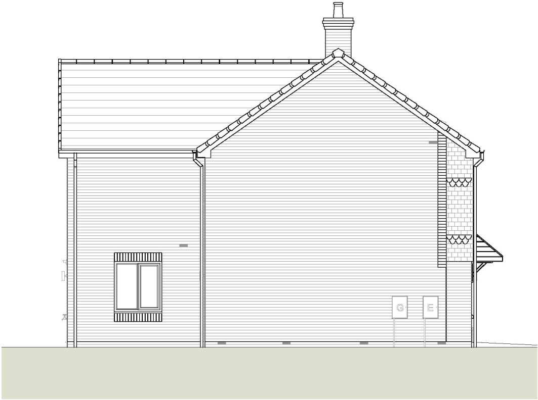
2 Gable Elevation 1 : 100