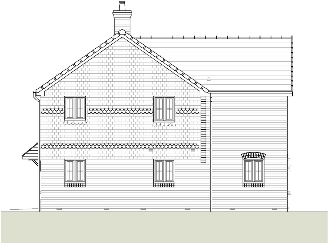
4 Gable Elevation 1 : 100