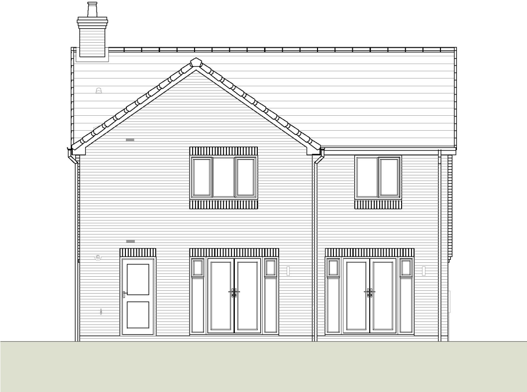
3 Rear Elevation 1 : 100