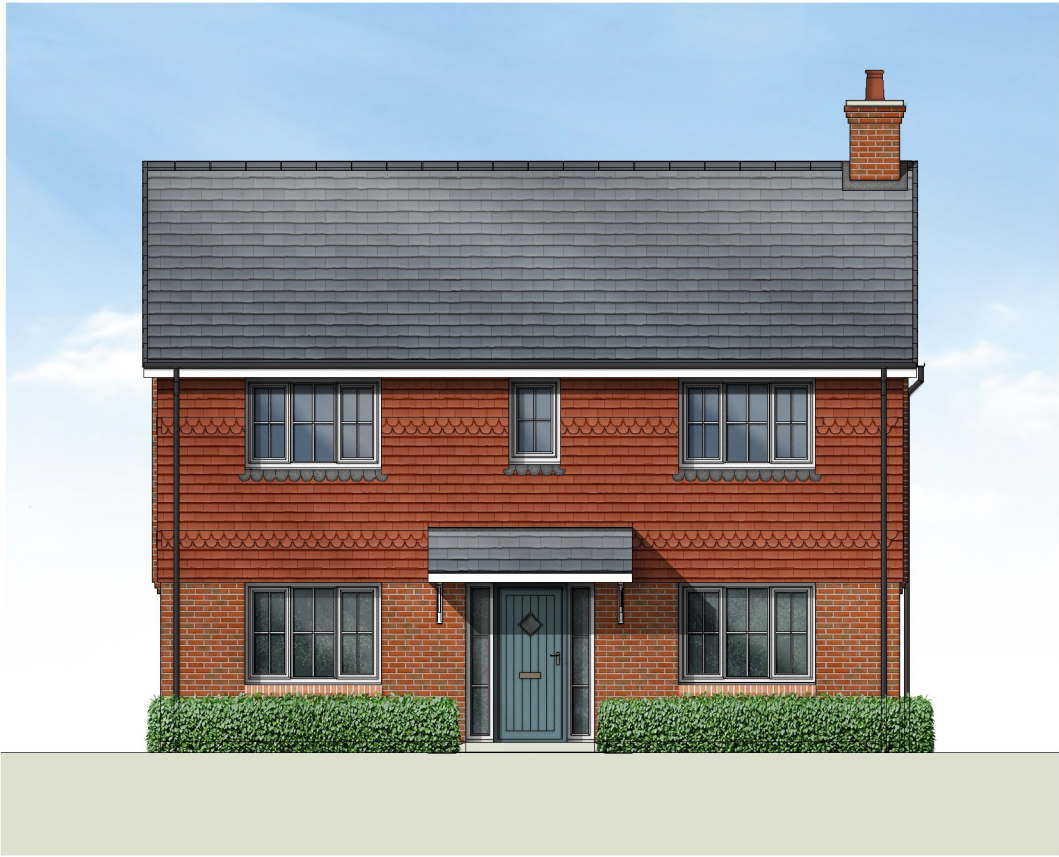
1 Front Elevation 1 : 100