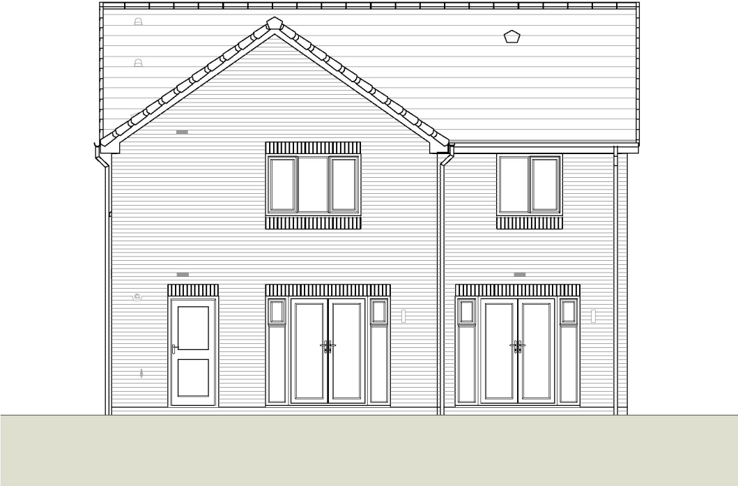
3 Rear Elevation 1 : 100