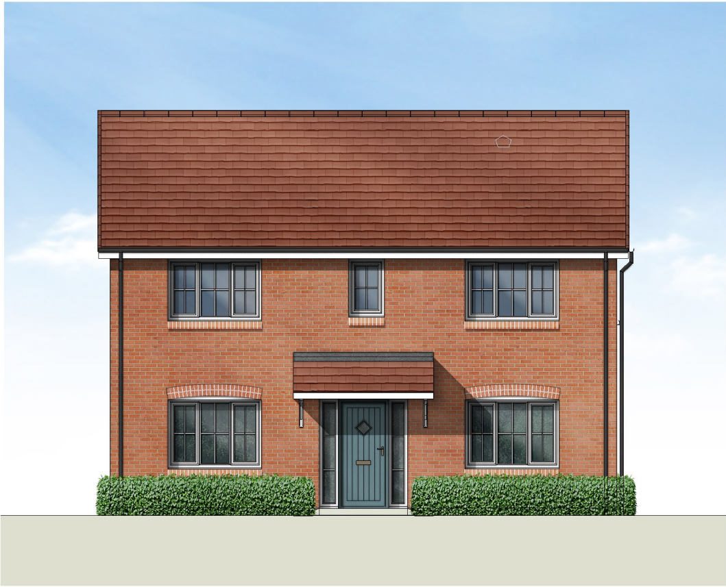
1 Front Elevation 1 : 100