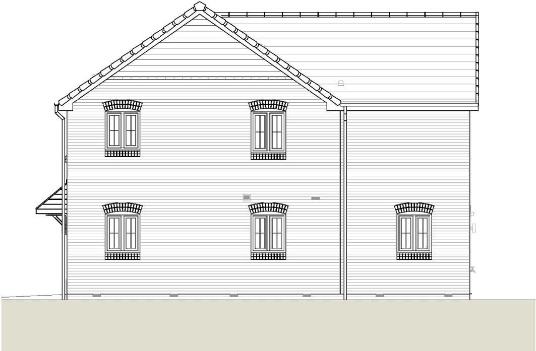
4 Gable Elevation 1 : 100