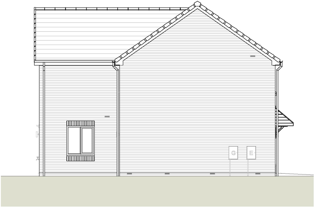
2 Gable Elevation 1 : 100