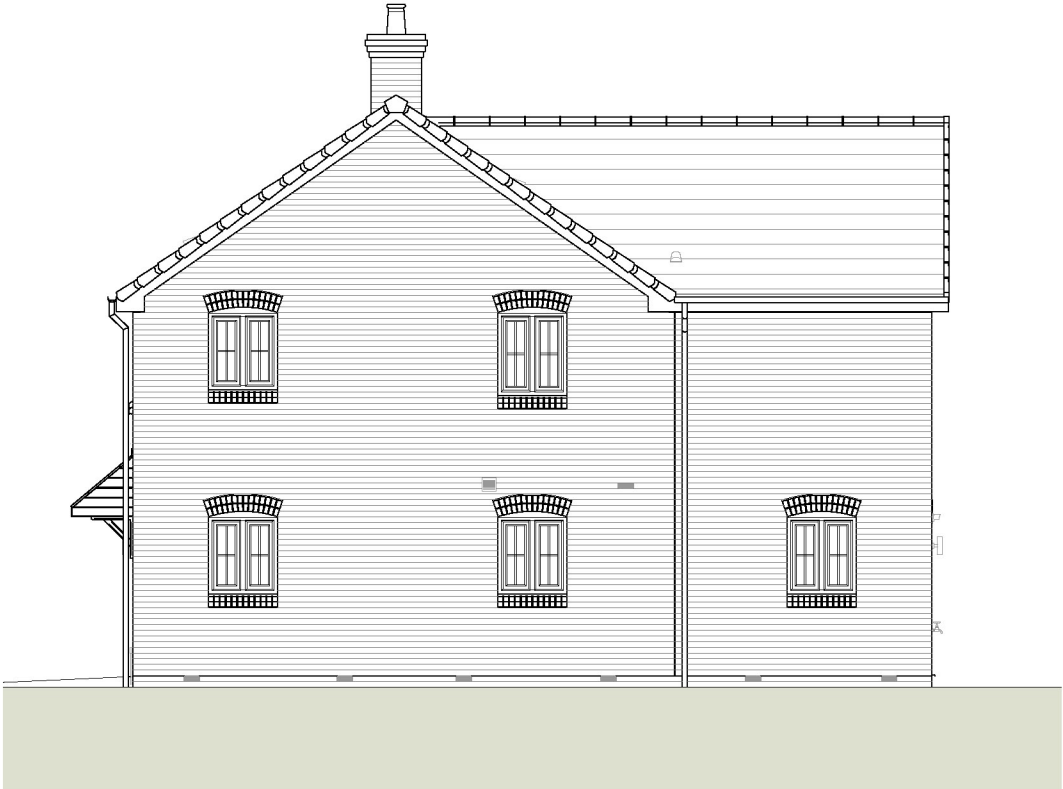
4 Gable Elevation 1 : 100