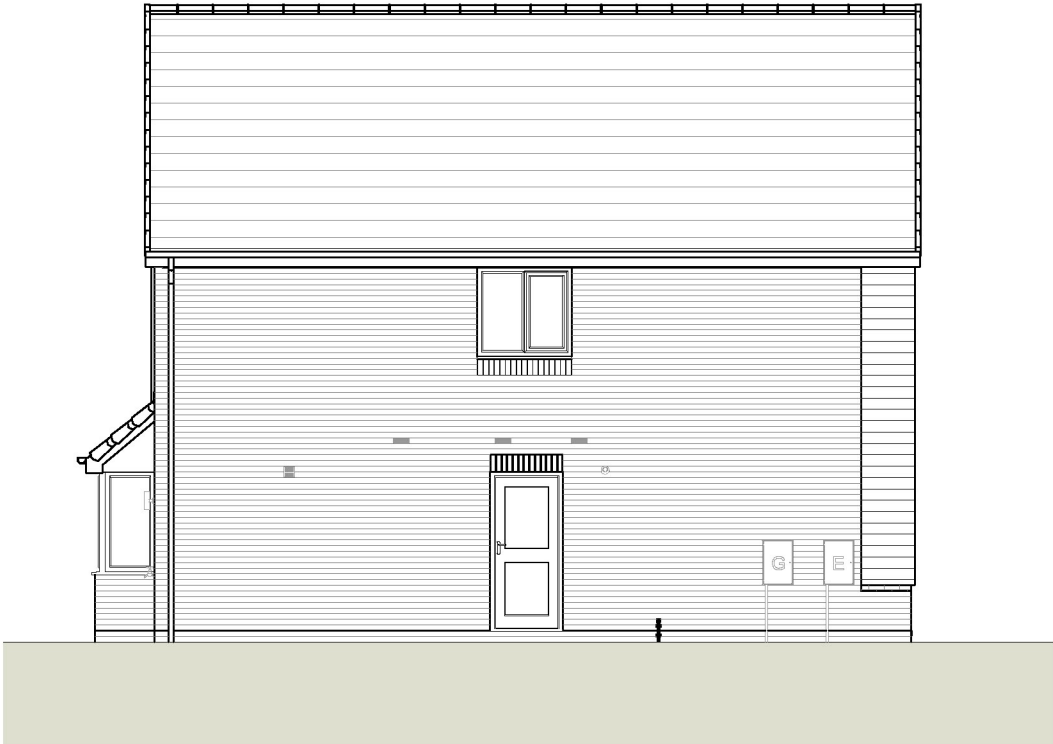
3 Rear Elevation 1 : 100