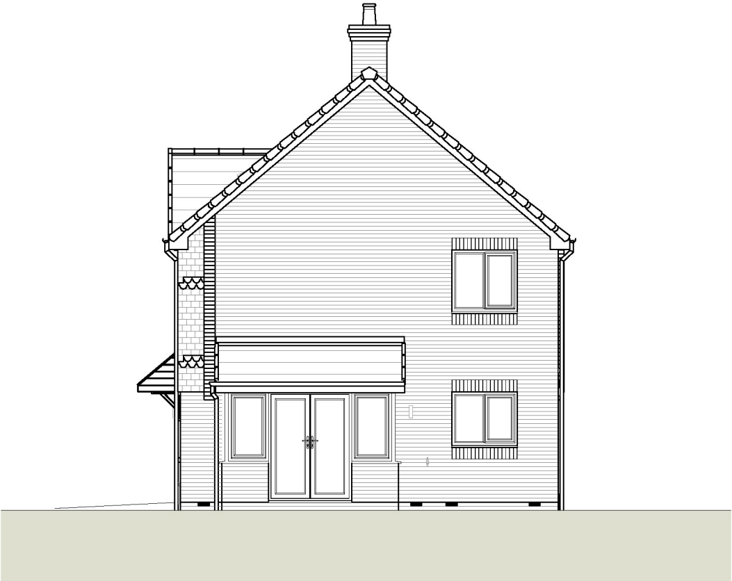
4 Gable Elevation 1 : 100