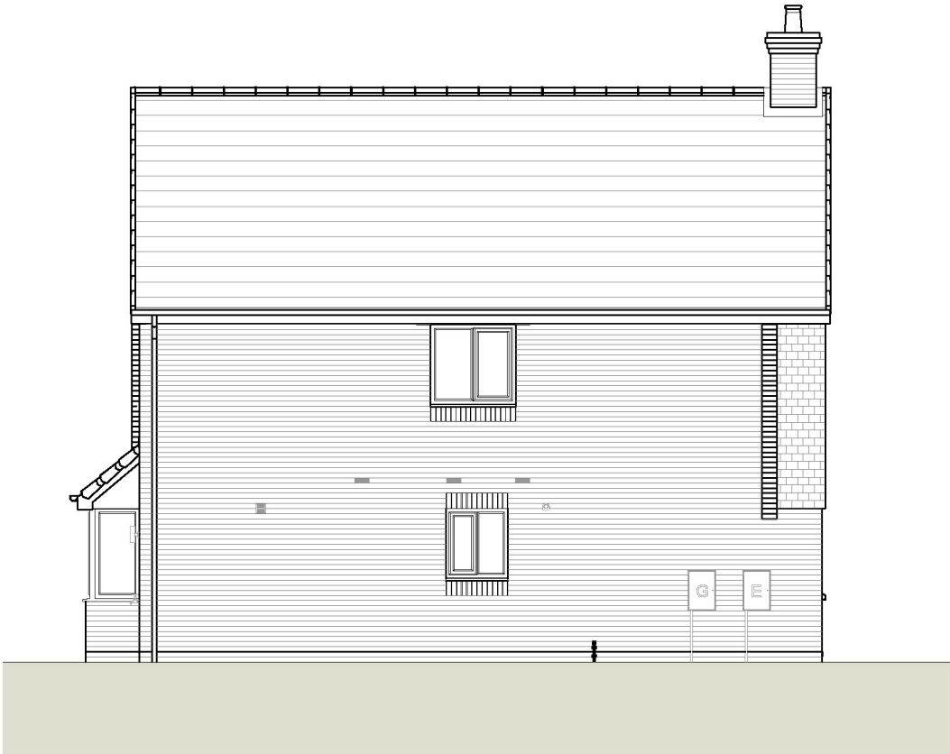
3 Rear Elevation 1 : 100