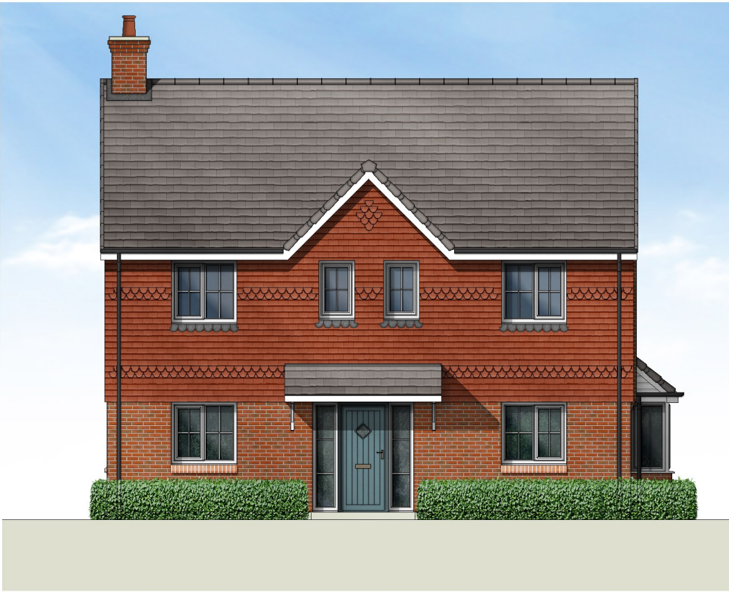
1 Front Elevation 1 : 100