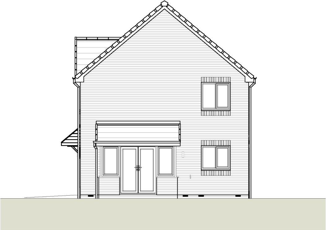
4 Gable Elevation 1 : 100