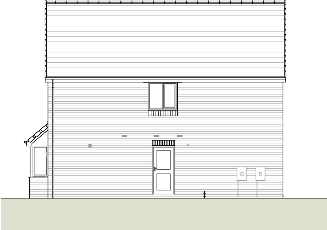
3 Rear Elevation 1 : 100