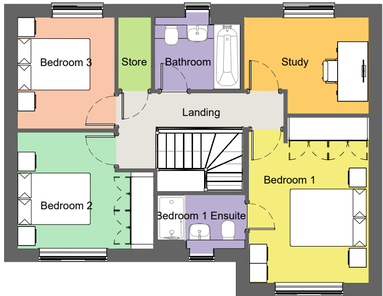
2 First Floor 1 : 100