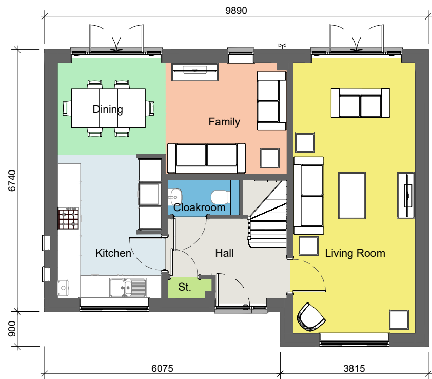
1 Ground Floor 1 : 100