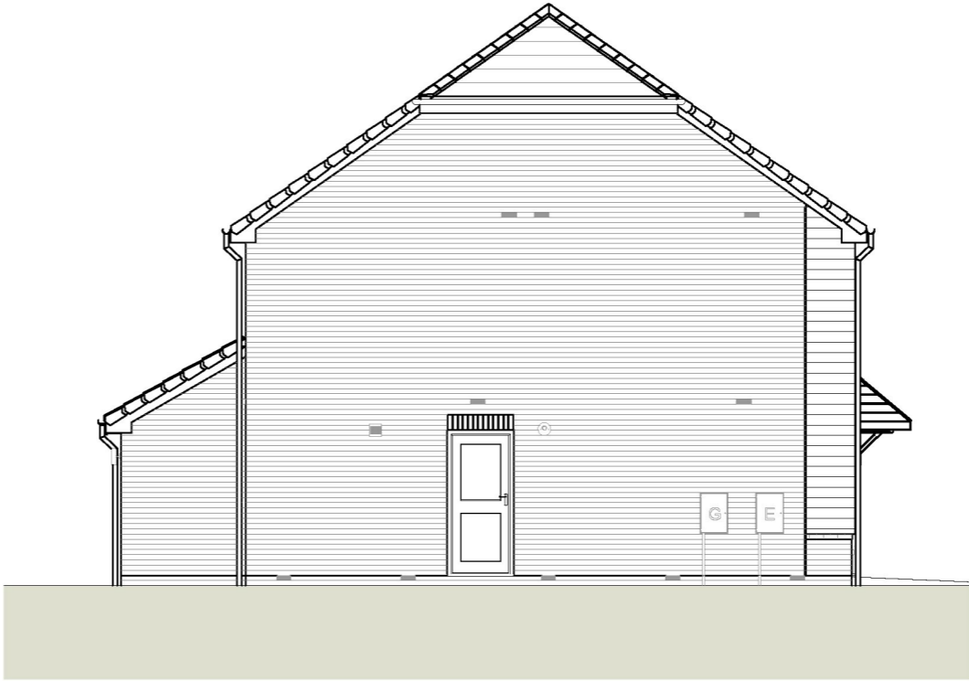
2 Gable Elevation 1 : 100