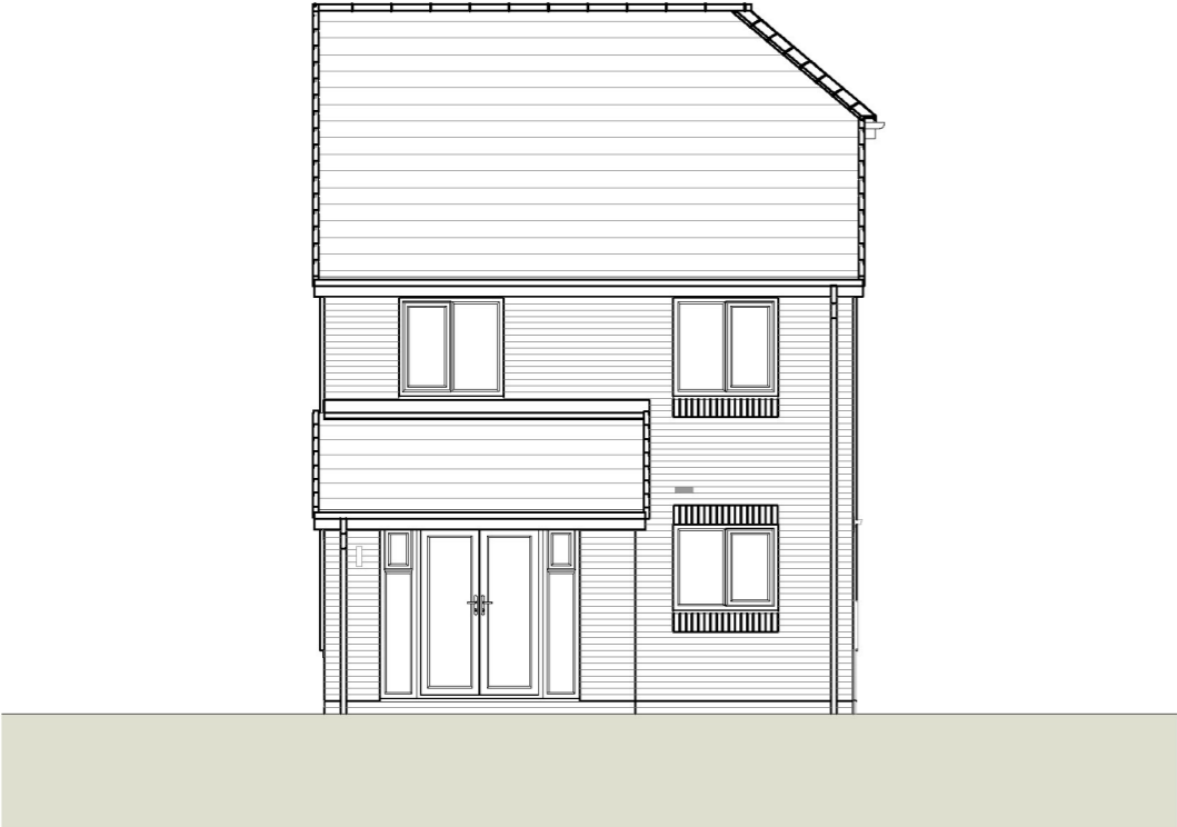
3 Rear Elevation 1 : 100