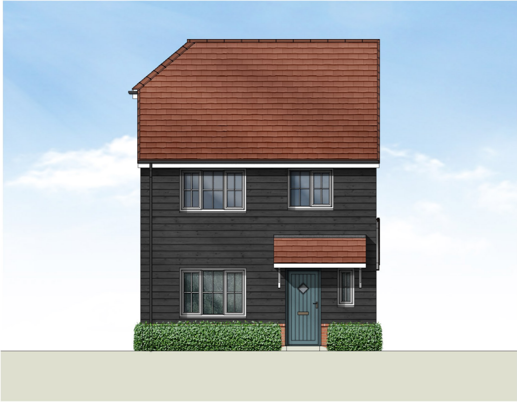
1 Front Elevation 1 : 100