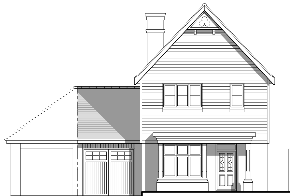
North east elevation - no changes to elevations