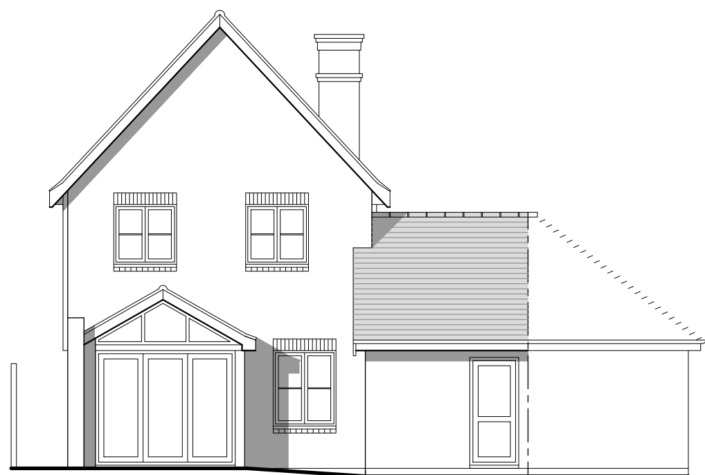
South east elevation - no changes to elevations