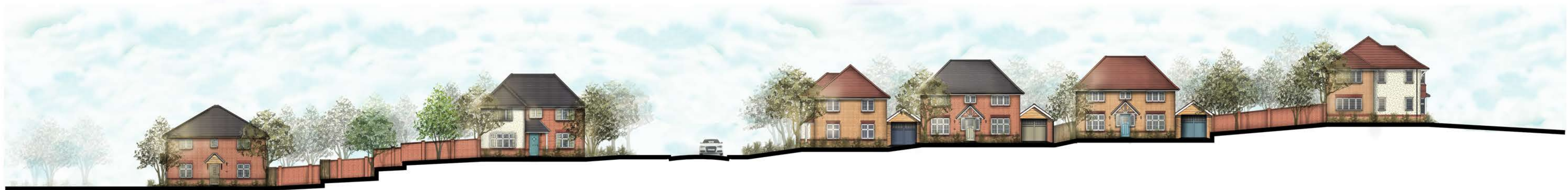
SPEY Plot 113-114 Street Scene B-B