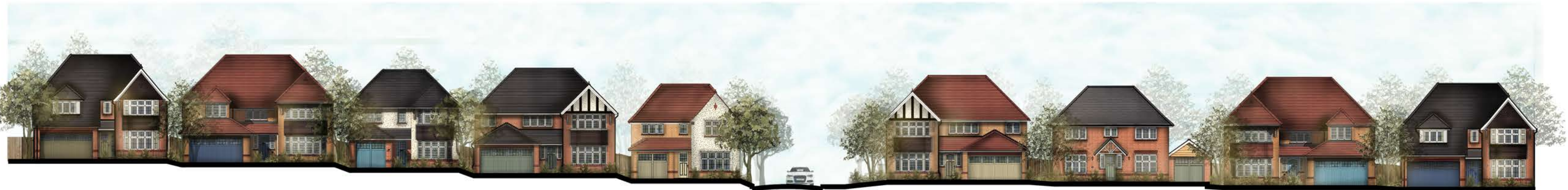
Street Scene D-D