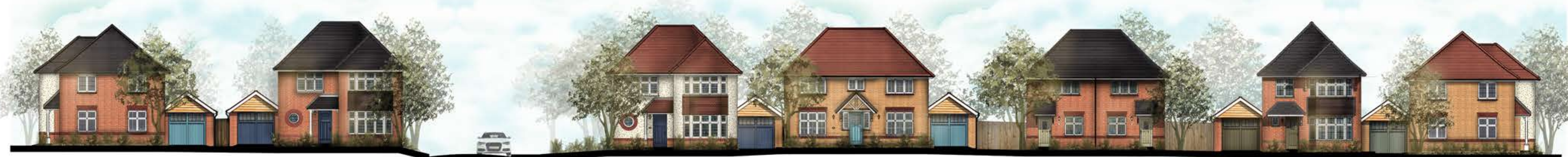
SHAFT Plot 120 Street Scene C-C