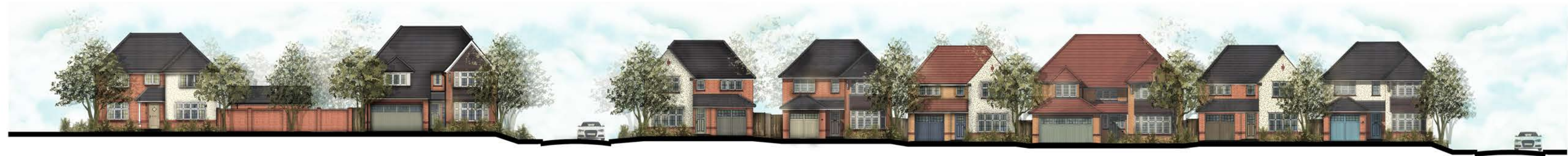
Street Scene A-A