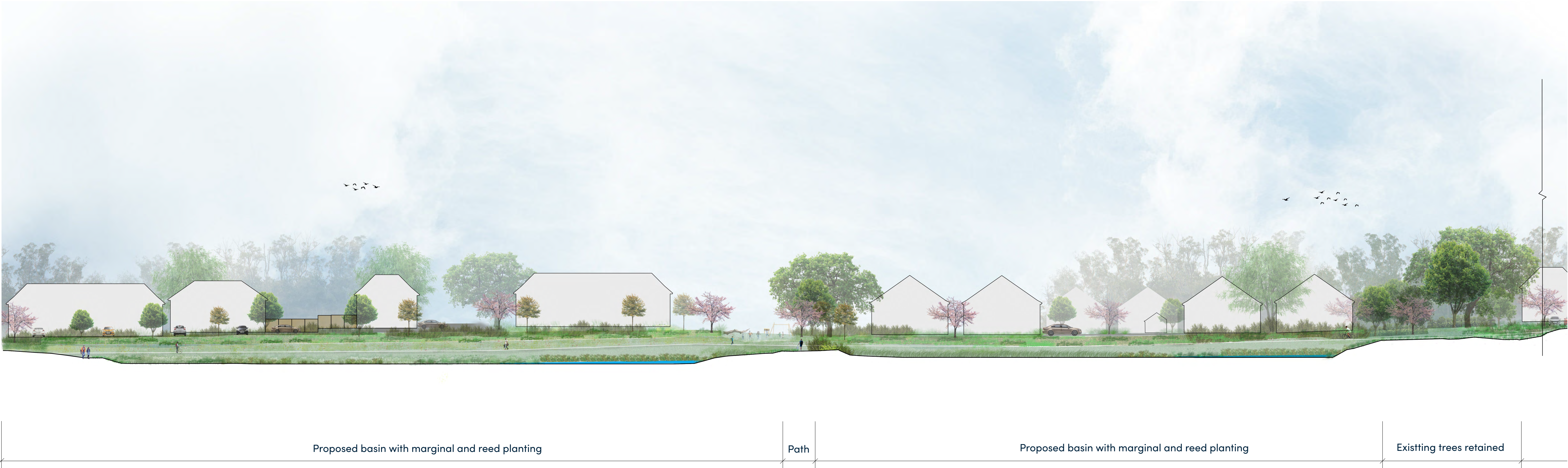
Illustrative Landscape Section 4-4'