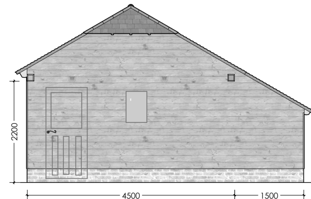
(S) RIGHT ELEVATION