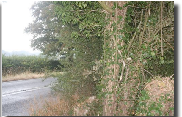
Site entrance looking Northwards at highway