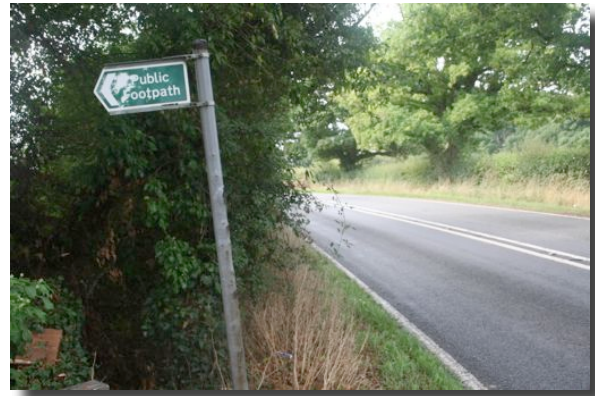
Site entrance looking Southwards at highway