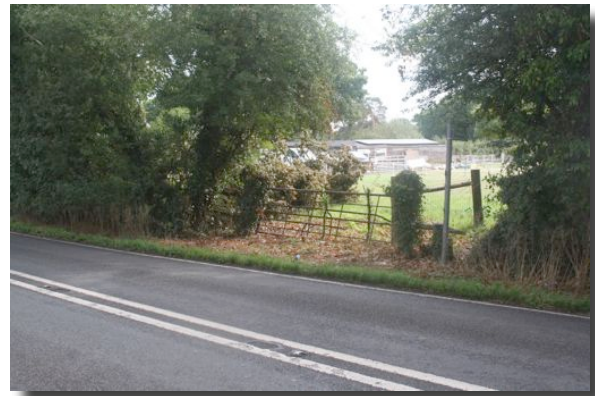
Site entrance looking - East towards site from highway

© Crown copyright 2022 Ordnance Survey 100053143