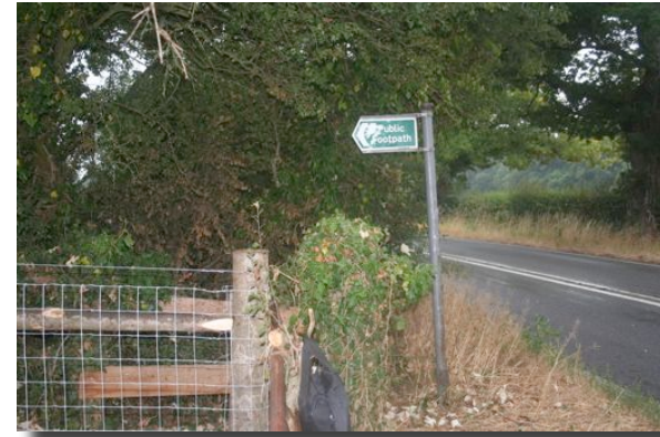
Site entrance looking Southwards at highway