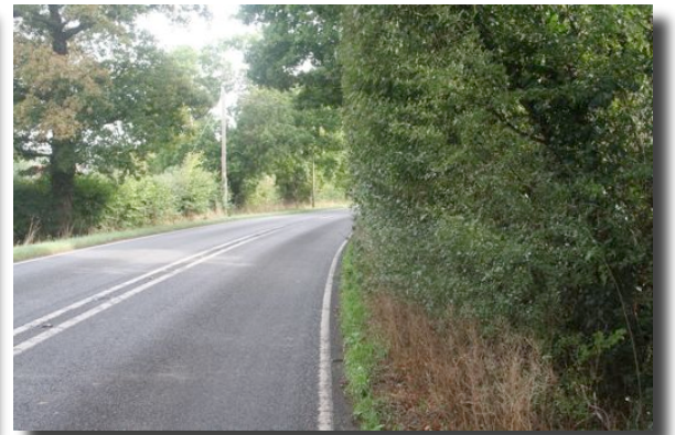
Site entrance looking Northwards at highway