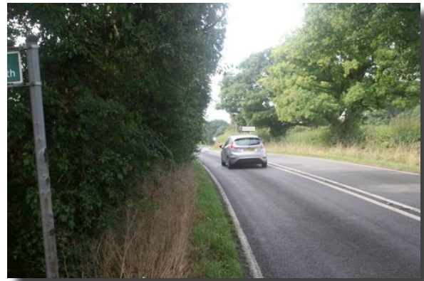
Site entrance looking Southwards at highway