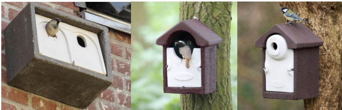
Figure 7: Examples of suitable bird boxes which could be installed on site – Vivara Pro WoodStone House Sparrow Nest Box (left), Vivara Pro Barcelona WoodStone Open Nest Box (centre) and Vivara Pro Seville 32mm WoodStone Nest Box (right)