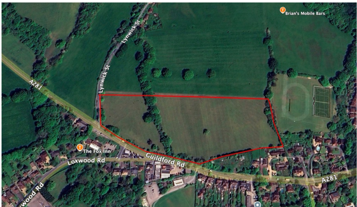
Figure 1: Approximate location of the red line boundary