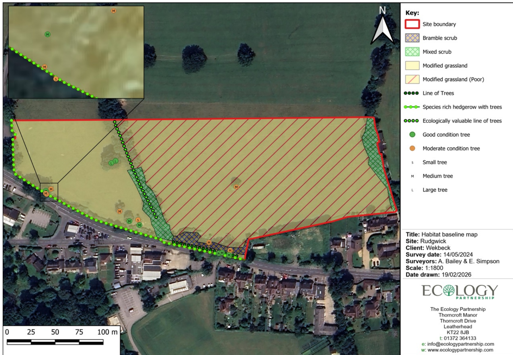
Figure 3: On-Site Habitat Baseline