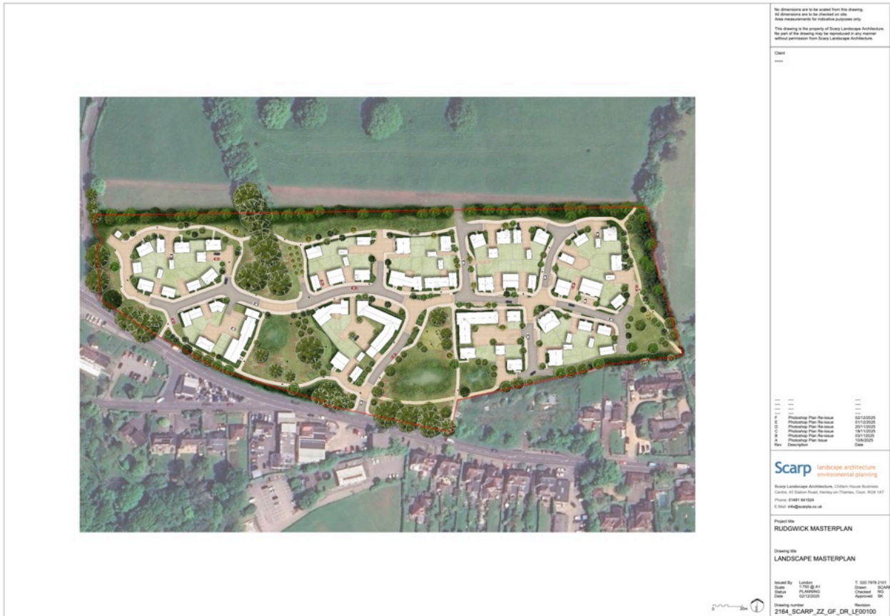
Figure 2: Landscape masterplan 2026