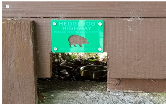
Figure 8: Hedgehog highway sign for fences (hedgehogstreet.org)