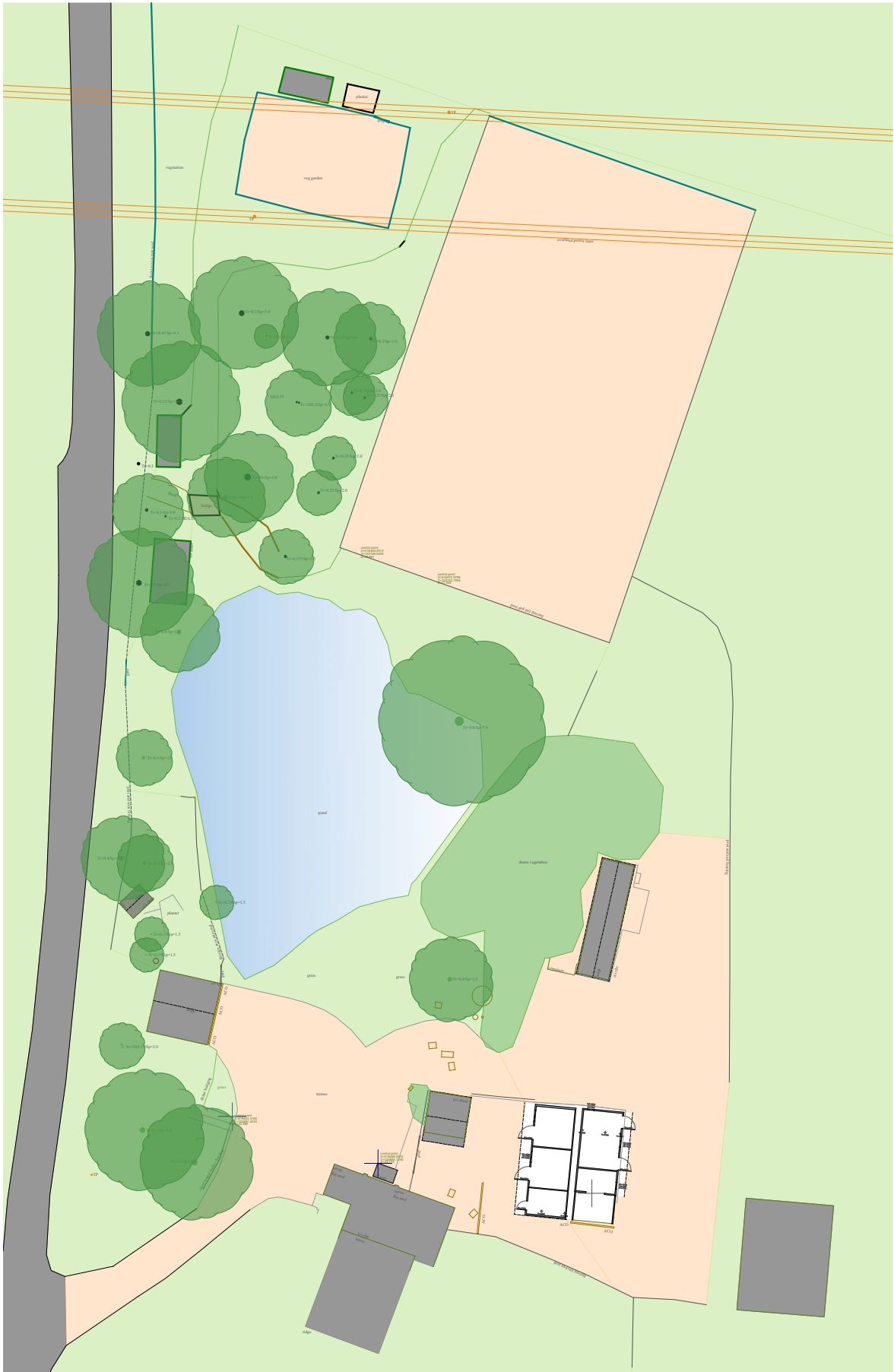
Block Plan 1:500 | EXISTING