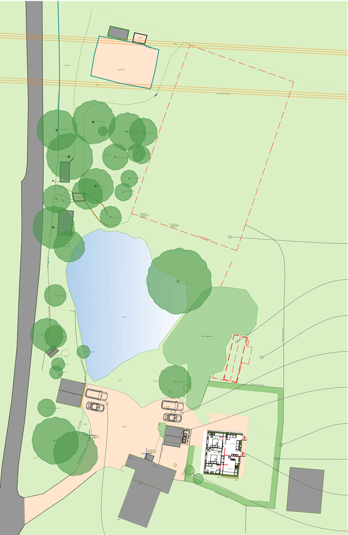
Block Plan 1:500 | PROPOSED